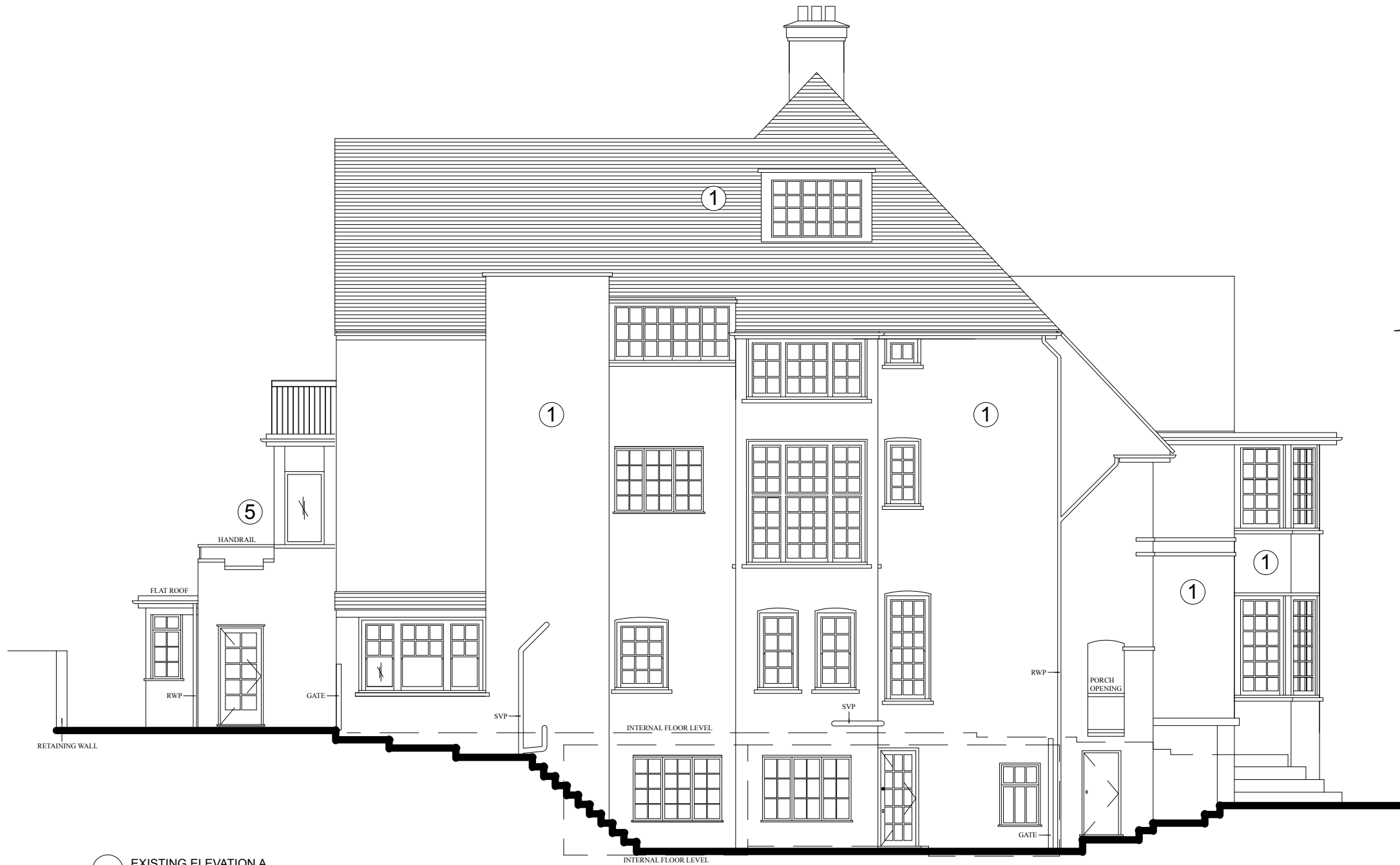
1 EXISTING ELEVATION A Scale: 1:50