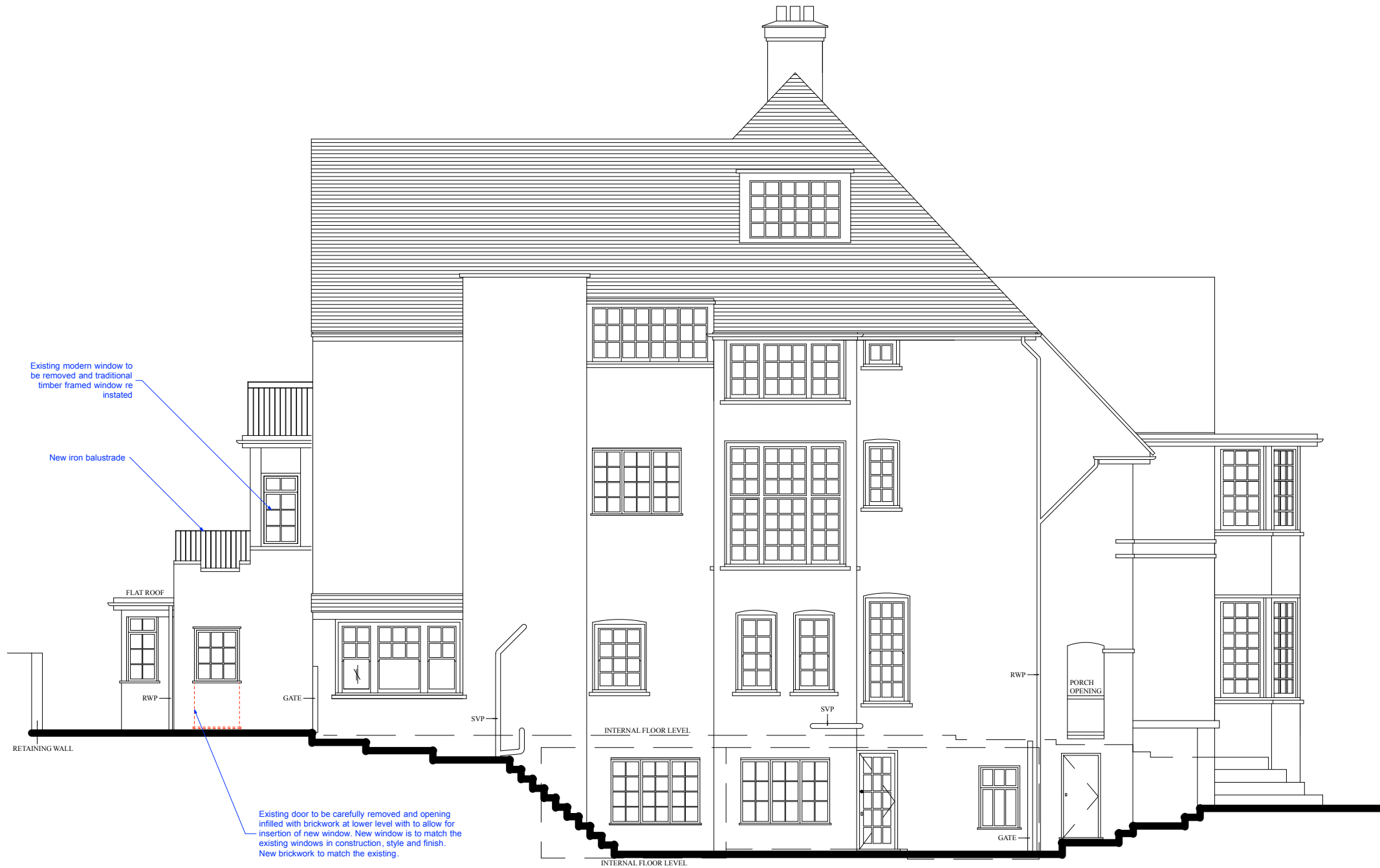
FLANK ELEVATION AT 'A'