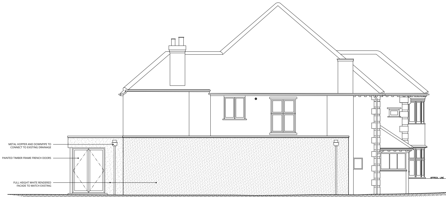
PROPOSED FLANK ELEVATION Scale 1:100