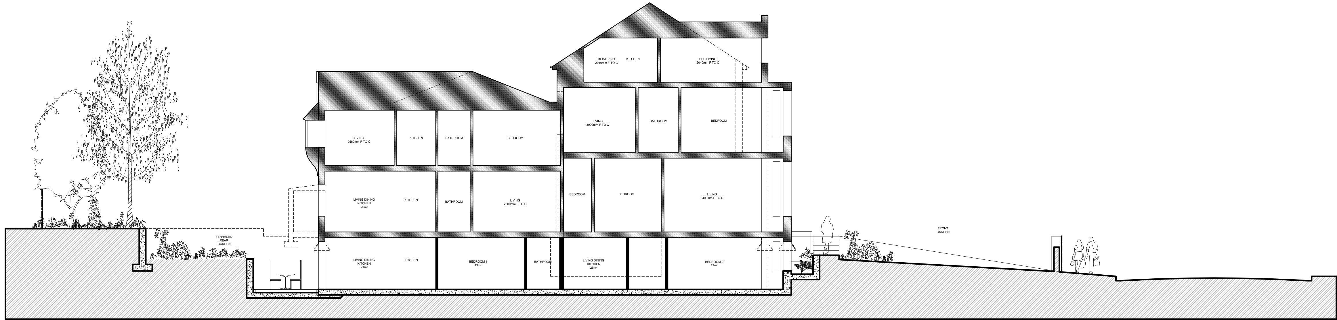
PROPOSED SECTION A-A 1:100