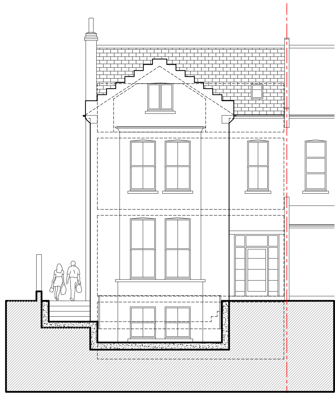
PROPOSED SHOOT-UP HILL ELEVATION 1:100

notes: Do not scale from this drawing All dimensions to be checked on site and any discrepancies reported to the Architect/Contract Administrator before proceeding with the works on site, or off-site fabrication