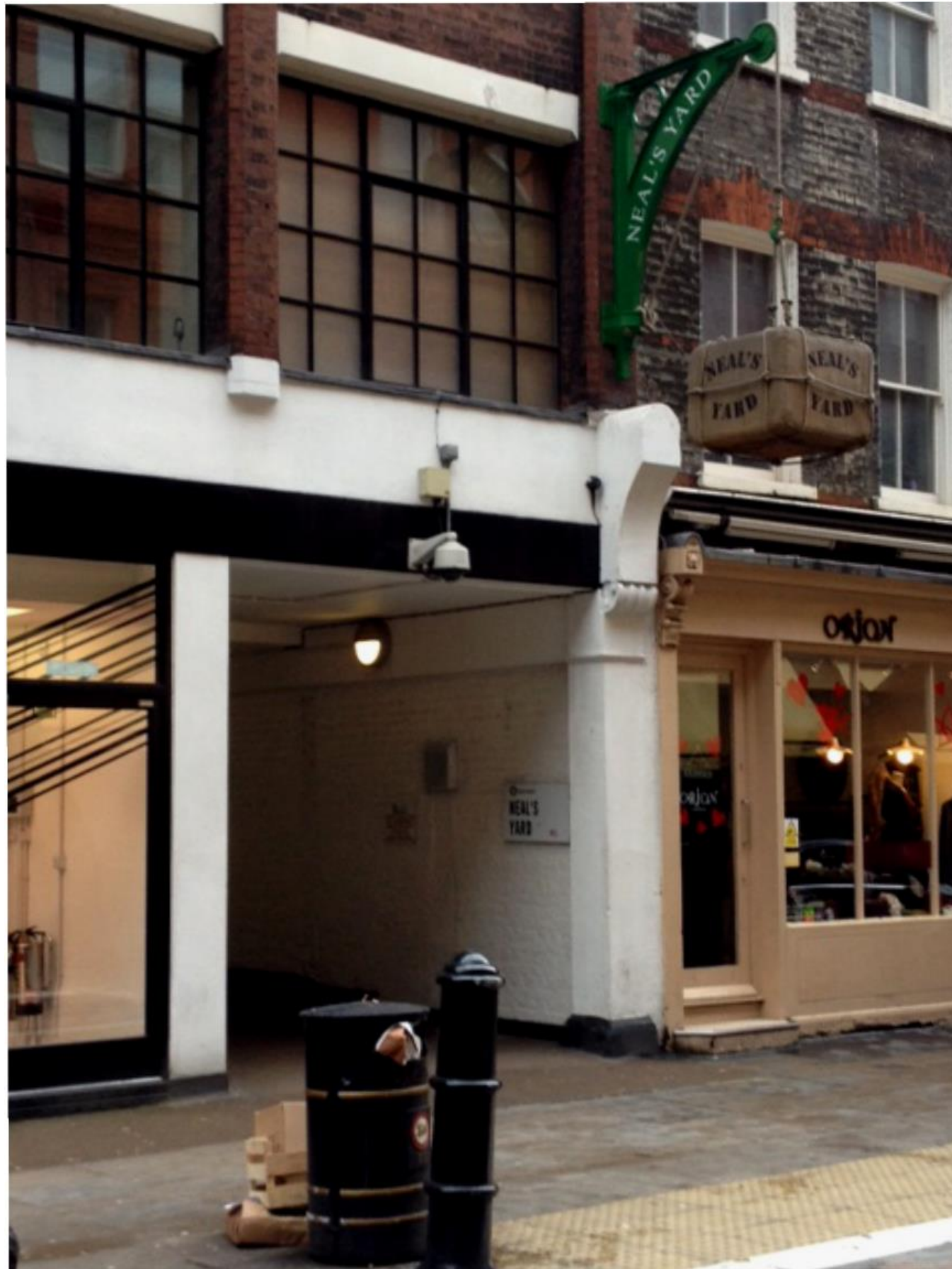
neal's yard : MONMOUTH ST. ENTRANCE 1 - EXISTING