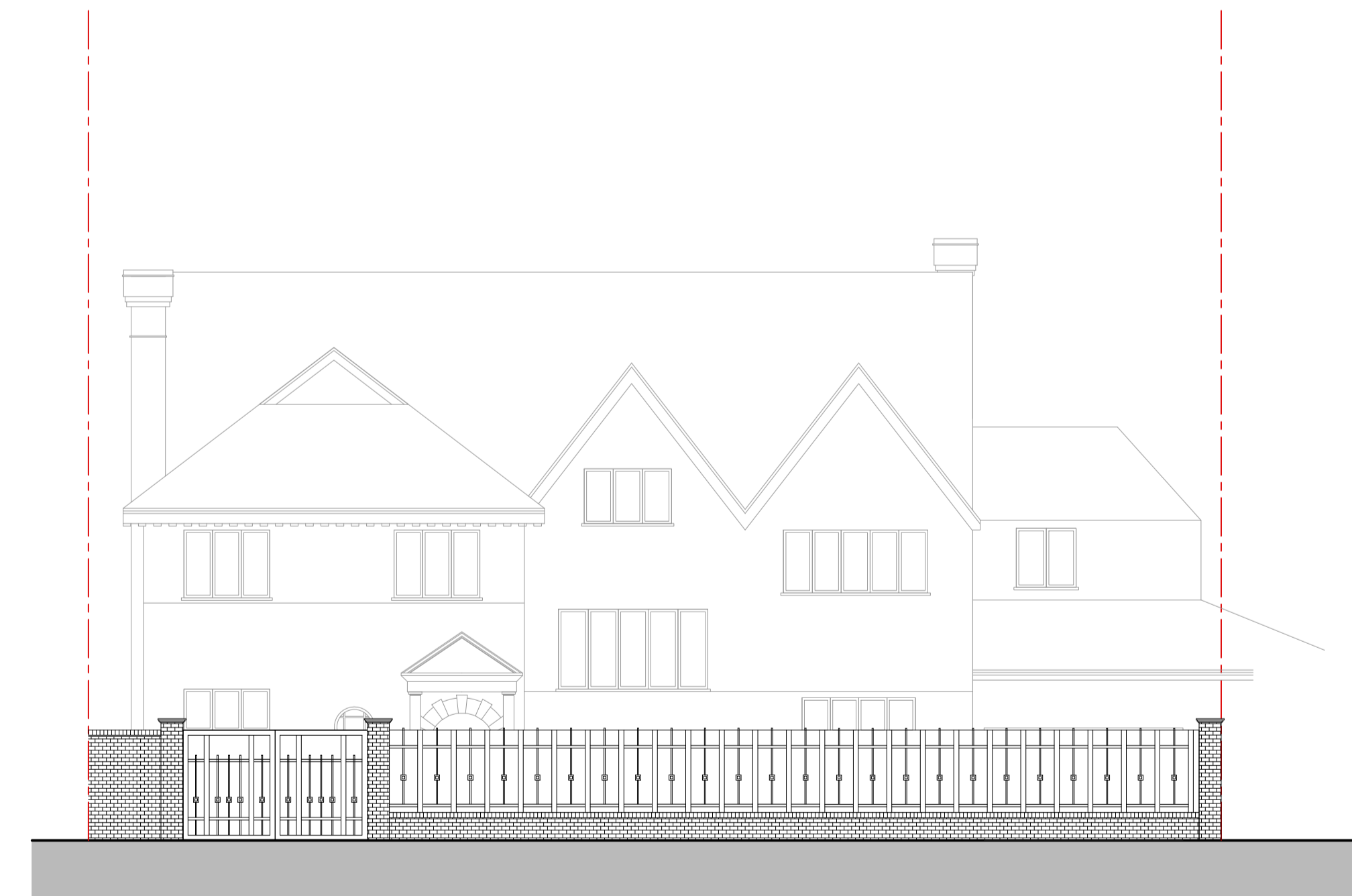
EXISTING FRONT ELEVATION SHOWING BOUNDARY SCALE 1:100