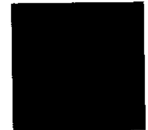
AWNING SAMPLE Ref: 407/6