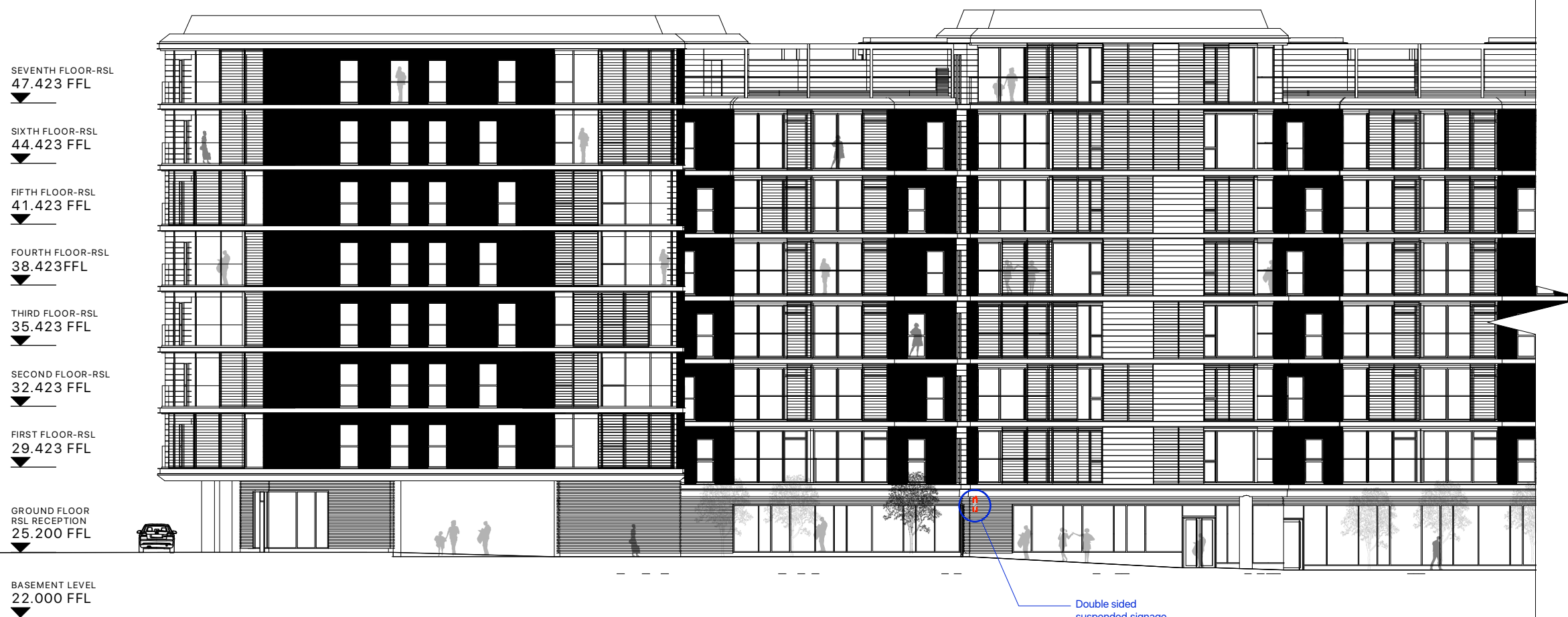
HANDYSIDE PARK ELEVATION Scale 1:250 @ A3