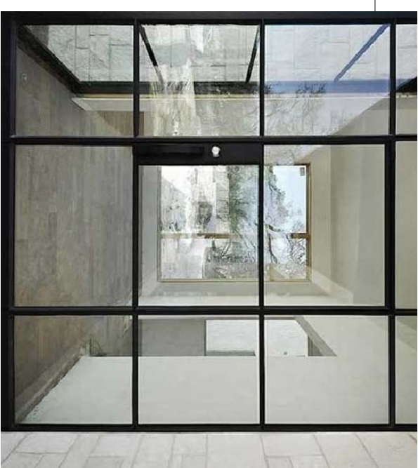
Six panel single door.