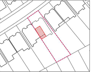
Site Plan - Scale 1:1000 @ A1

NOTES DO NOT SCALE FROM THIS DRAWING. ALL DIMENSIONS TO BE CHECKED ON SITE. ALL OMISSIONS AND DISCREPANCIES TO BE REPORTED TO THE ARCHITECT IMMEDIATELY.