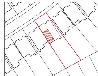
Site Plan - Scale 1:1000@ A1

NOTES DO NOT SCALE FROM THIS DRAWING. ALL DIMENSIONS TO BE CHECKED ON SITE. ALL OMISSIONS AND DISCREPANCIES TO BE REPORTED TO THE ARCHITECT IMMEDIATELY.