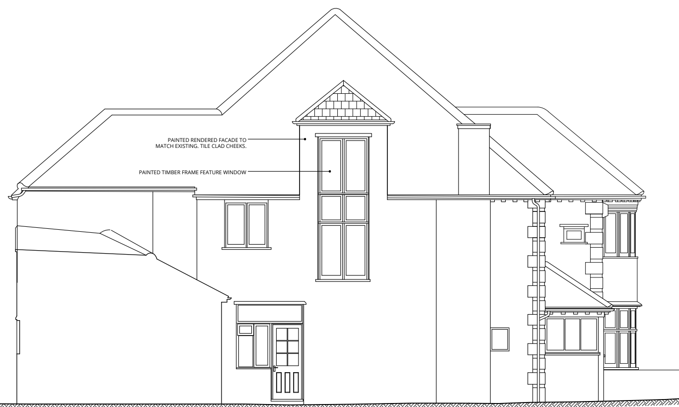
PROPOSED FLANK ELEVATION Scale 1:100