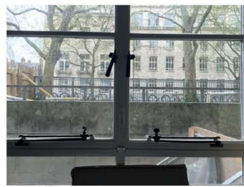
TOP LEFT: WINDOW W-G06-1 TOP MIDDLE: TOP OF WINDOW TOP RIGHT: WINDOW IRONMONGERY MIDDLE LEFT: TIMBER SURROUND MIDDLE: EXISTING IRONMONGERY MIDDLE RIGHT: WINDOW DETAIL