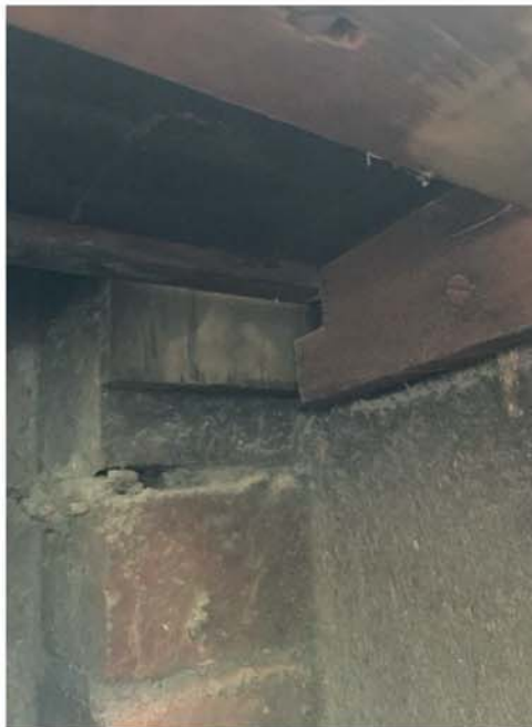
ABOVE: SLOTS TO TIMBER CILL BELOW: UNDERSIDE OF EXISTING TIMBER WINDOW CILL