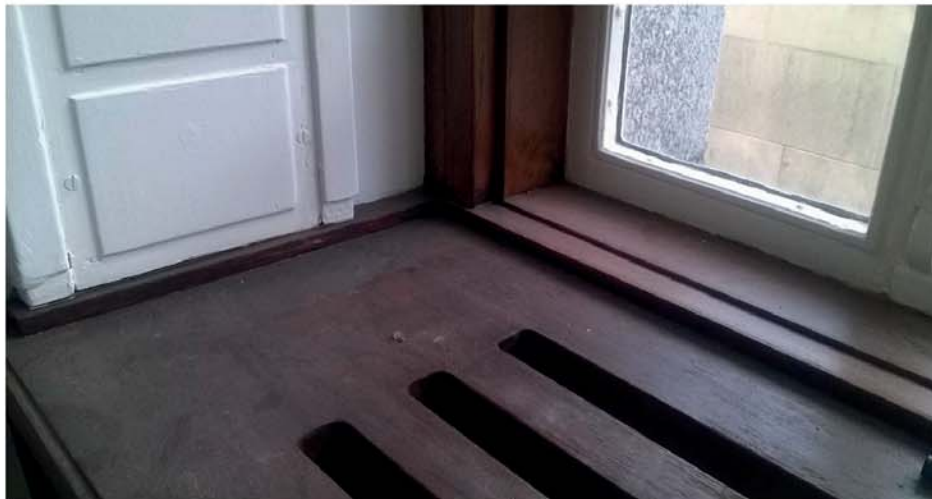
EXISTING WINDOW TO W-G06-1 SINGLE GLAZED