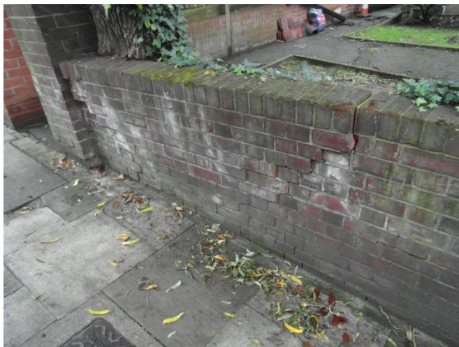
Langland Gardens Walls