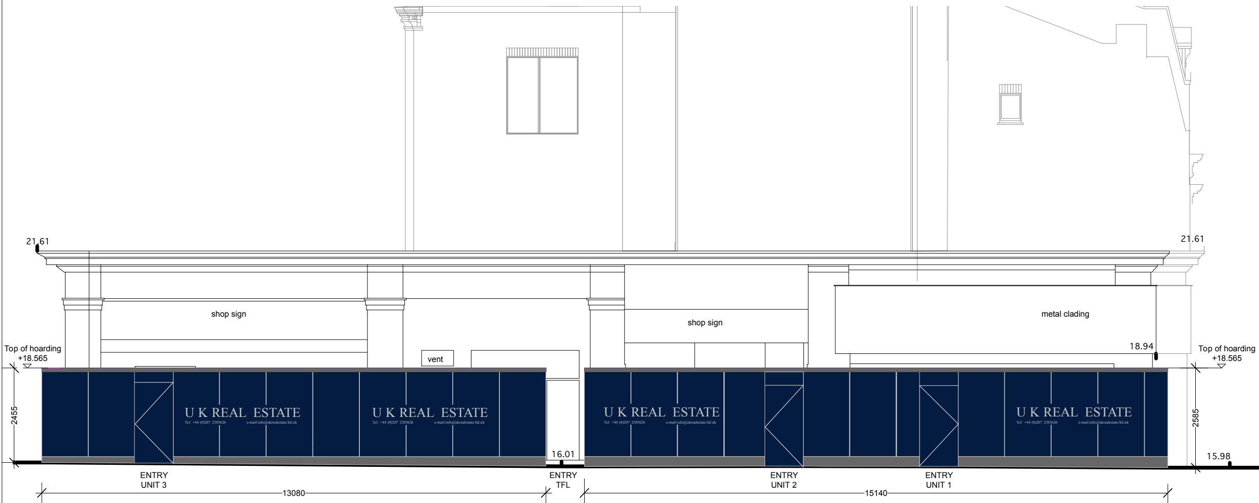
P R O P O S E D K I N G S C R O S S B R I D G E E L E V A T I O N

GENERAL NOTES Drawing to be read in conjunction with all information by architects, structural engineer & service consultants. The contractor is not to scale from this drawing. All written dimensions to be checked on site before work commences. Discrepancies, where identified, must be reported to the architect immediately. This drawing is the property of Latitude Architects and Designers and must not be reproduced or disclosed to any unauthorised person either wholly or in part without written consent.