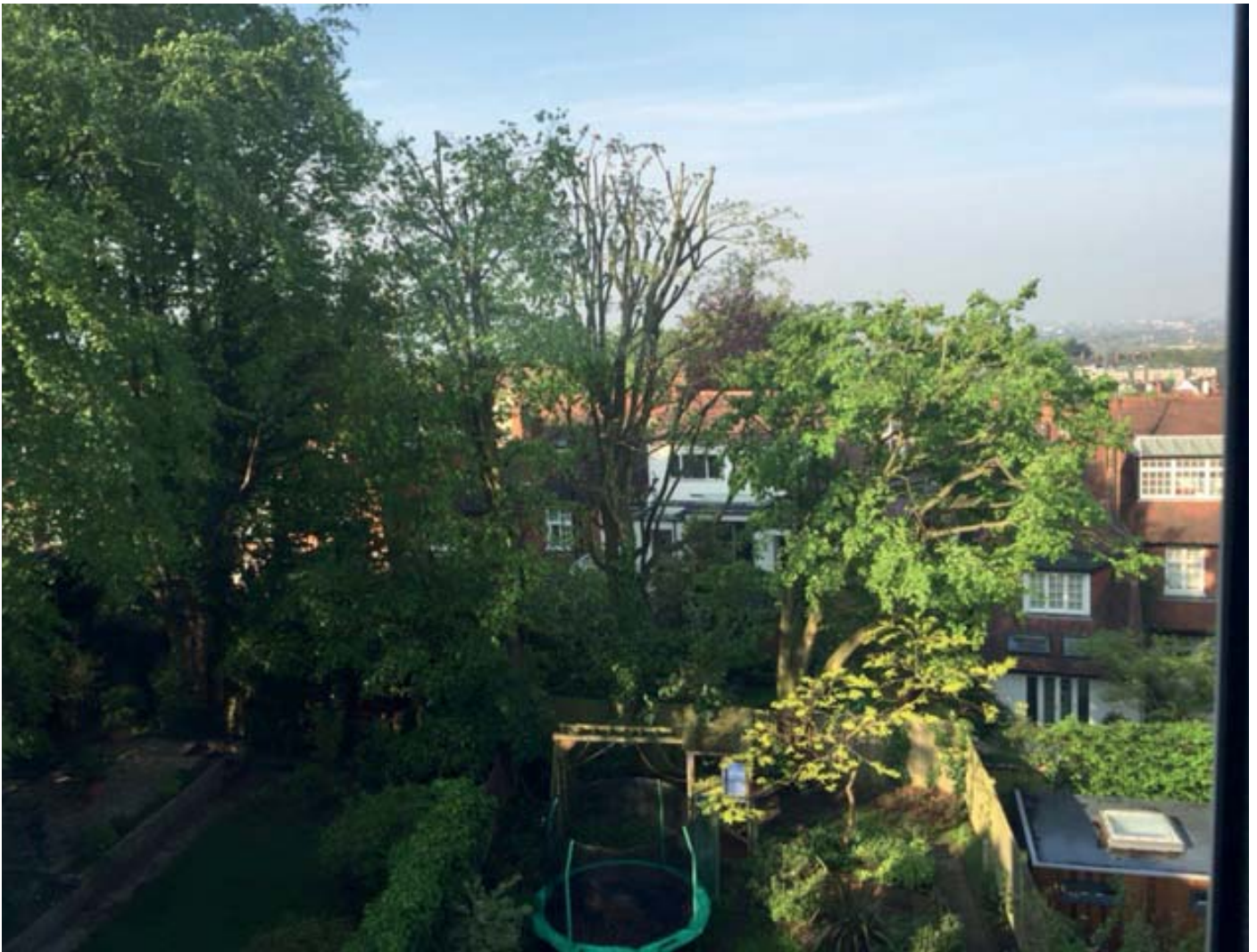
Views from the second floor bathroom window.

Above : view through an opening pane of the window shows how it could be opened up with the proposed glazed elevation.