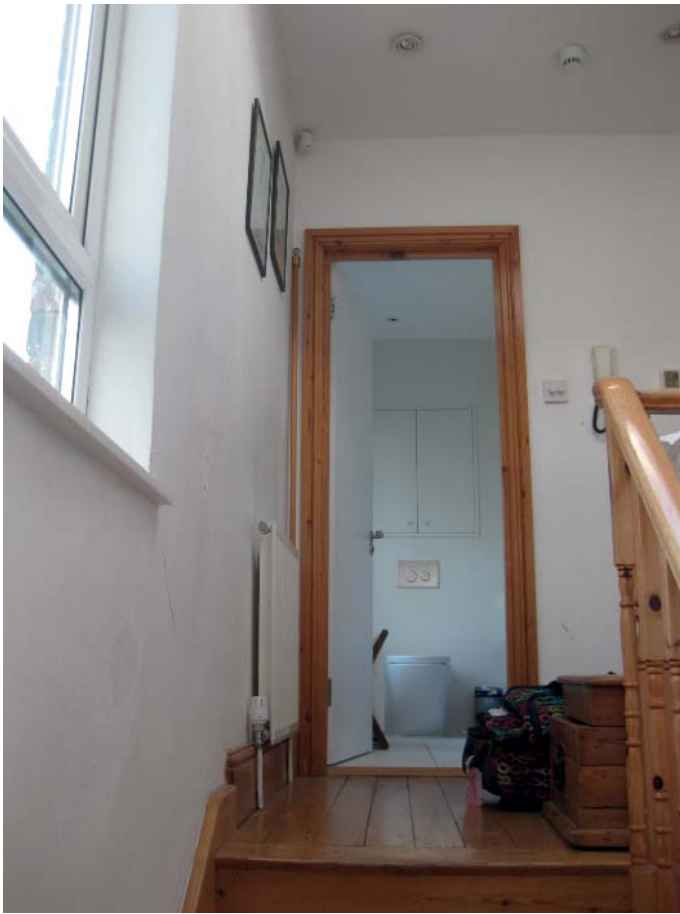
Above : view of second floor landing Below : view out of first floor stair window

Views of the stairwell and window at second floor, view out of the stair window and view of the second floor bathroom and it's rear window.