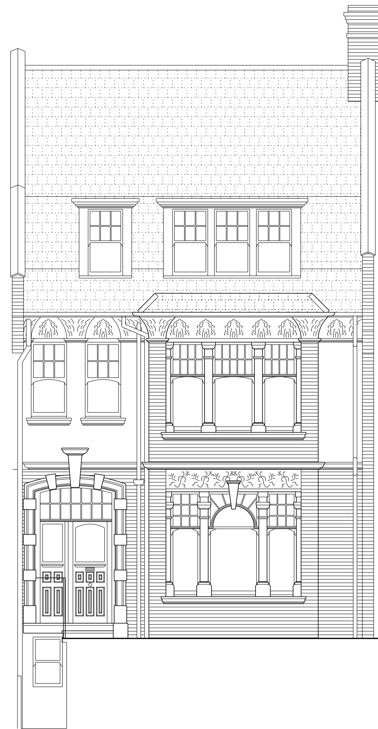
02 EXISTING EAST ELEVATION 1:50