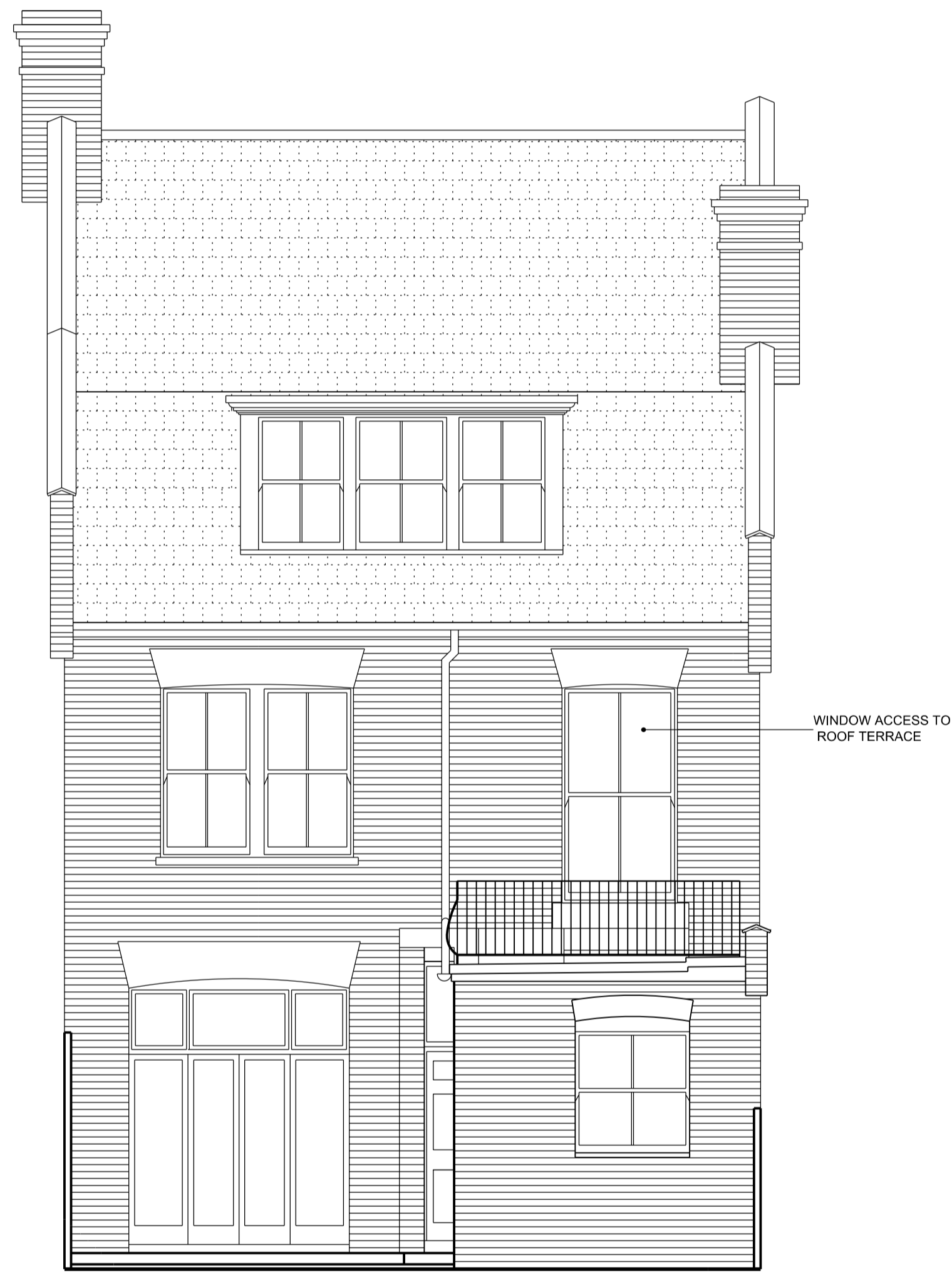
01 EXISTING WEST ELEVATION 1:50