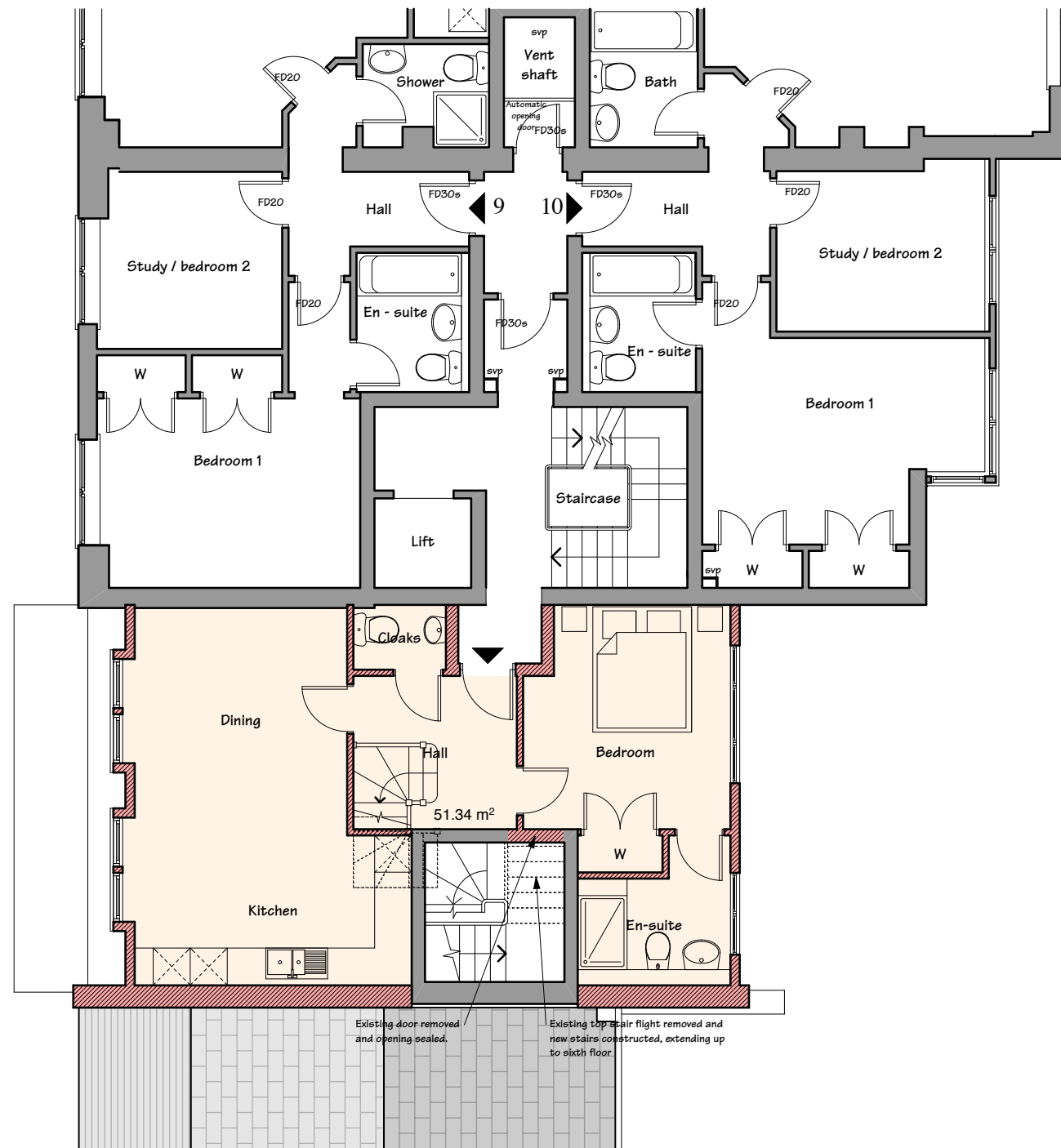
FIFTH FLOOR PLAN