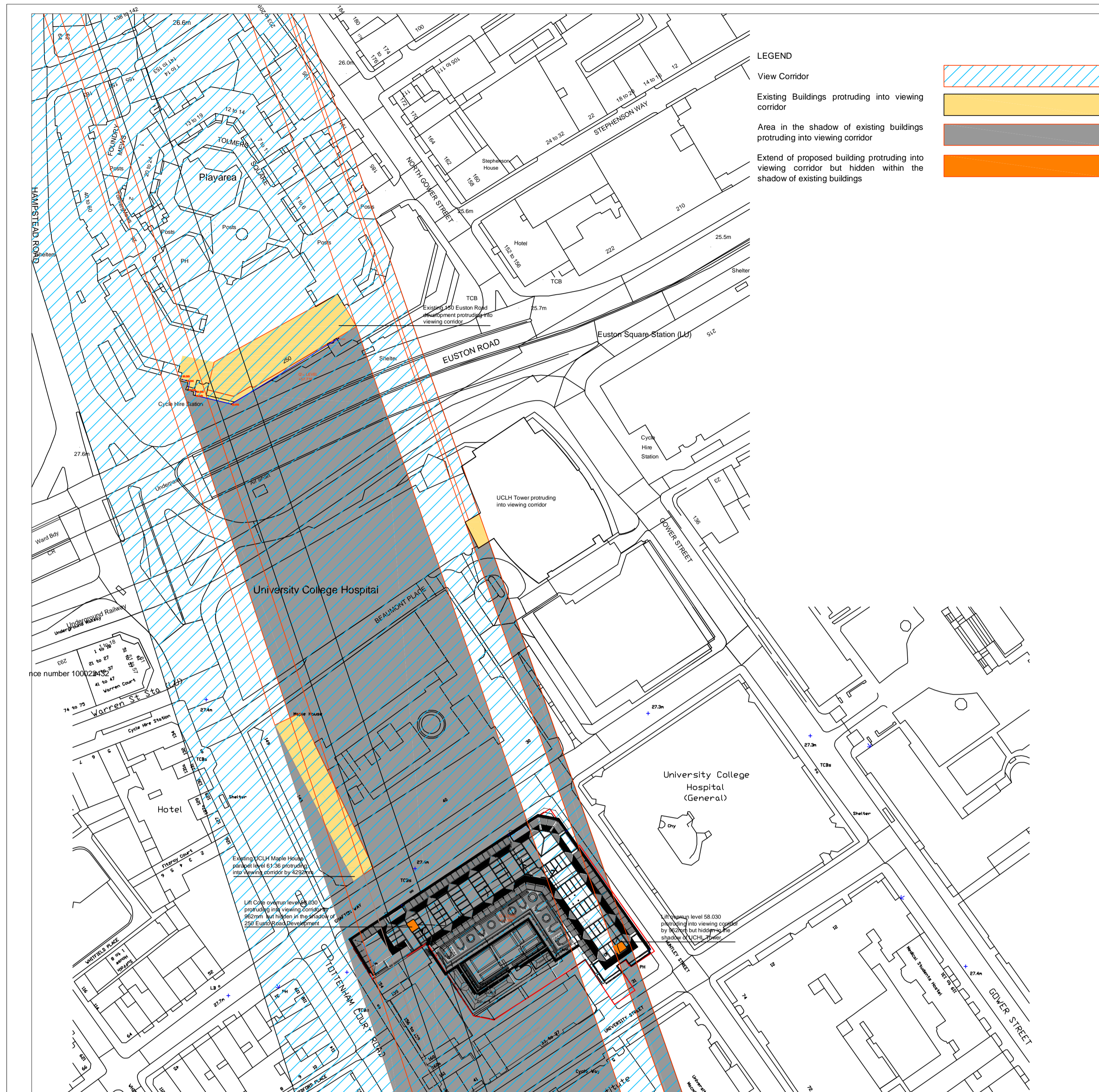
View Corridor Study Site Plan Indicating Location of the Viewing Corridor Scale 1/1000