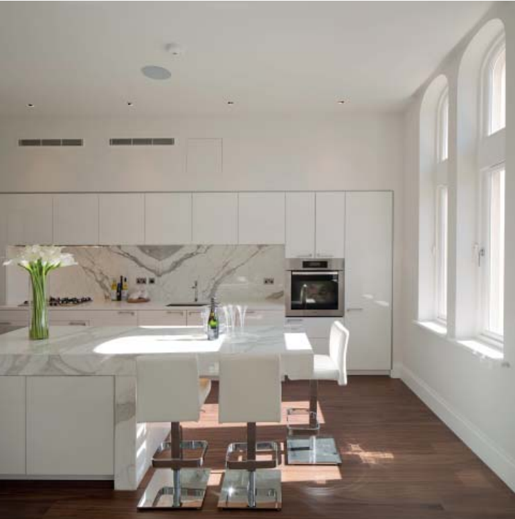
Netherhall Gardens - Conservation Residential Conversion