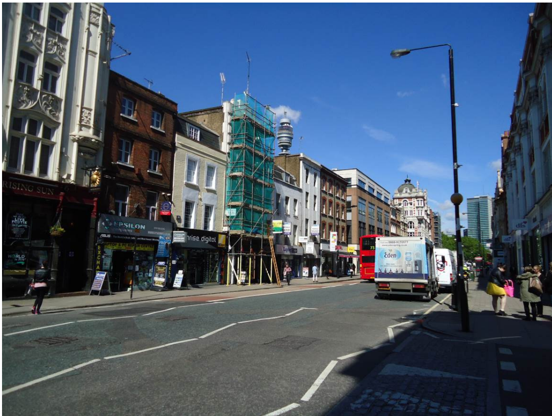
Frontage to Tottenham Court Road from Windmill street to Goodge Street (Site towards centre of image)