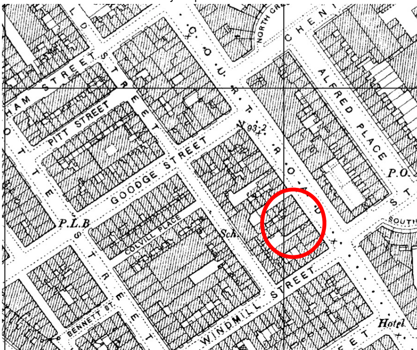
1896 1:2500 Ordnance Survey map 2