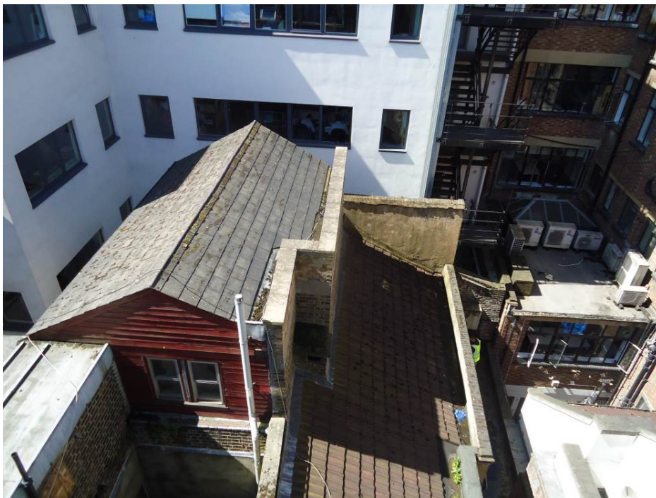
Additions and extension to rear (and modern context to the rear) seen from above