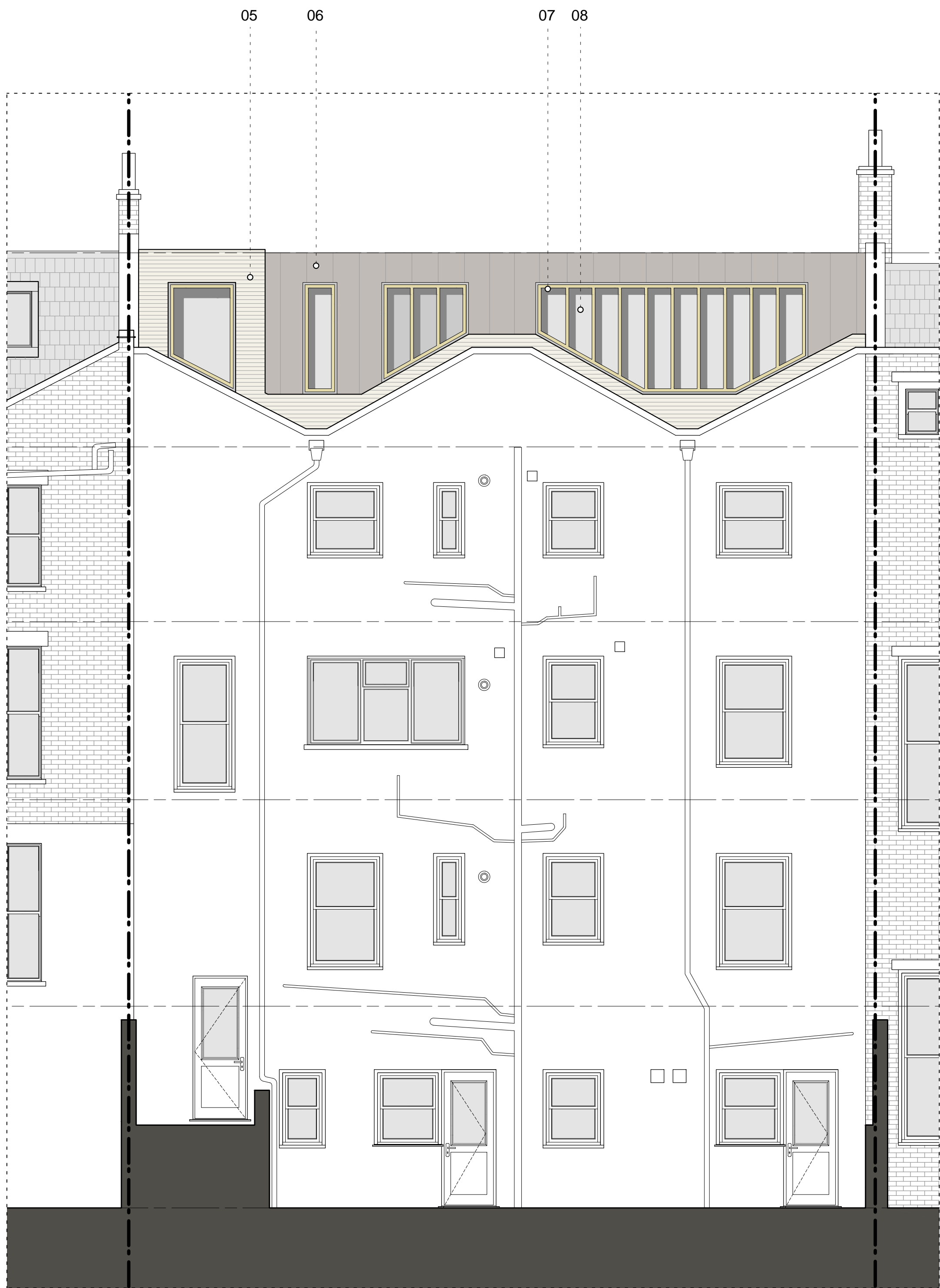
PROPOSED ELEVATION B

Notes Do not scale from drawing unless for planning purposes. All dimensions to be checked on site. All levels to be checked on site. All setting out must be checked on site. This drawing is copyright WhitemanDesign. This drawing must not be used onsite unless 'Issued for Construction'.