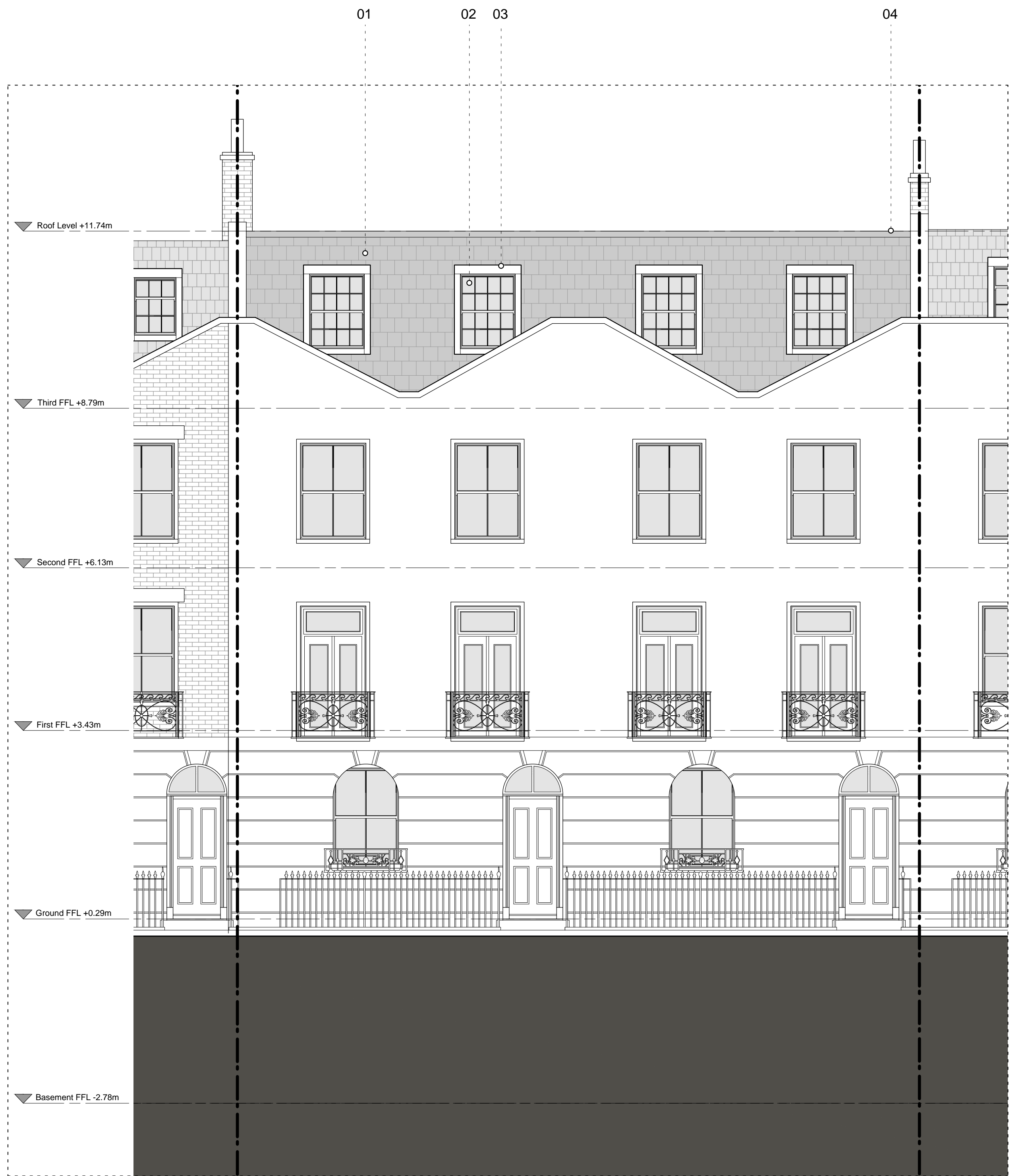
PROPOSED ELEVATION A