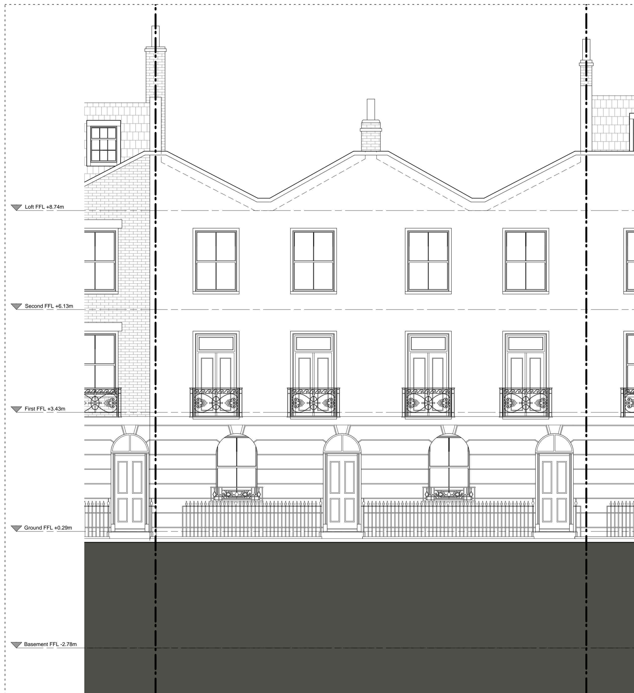
EXISTING ELEVATION A