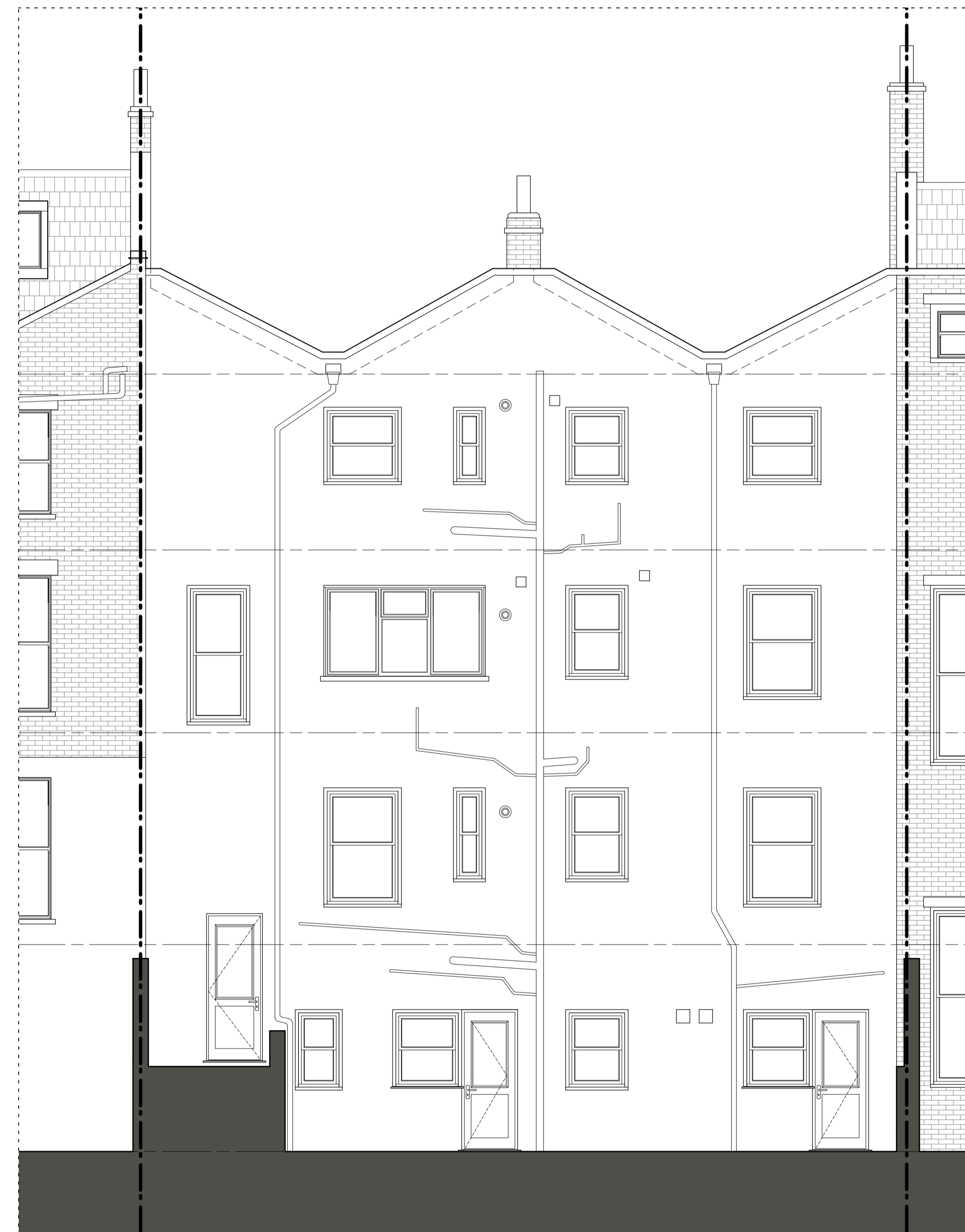
EXISTING ELEVATION B