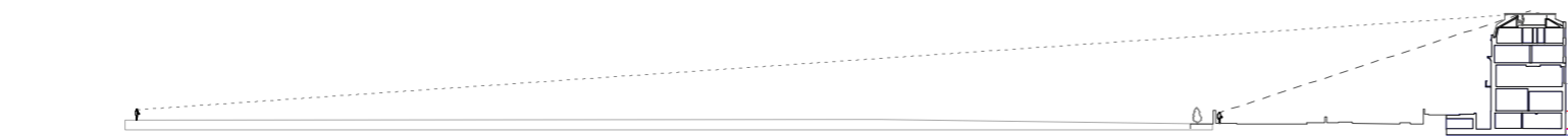
3 Scale: 1:1250 25 CHESTER TERRACE- PROPOSED / STREETScape VIEW FROM REGENT'S PARK