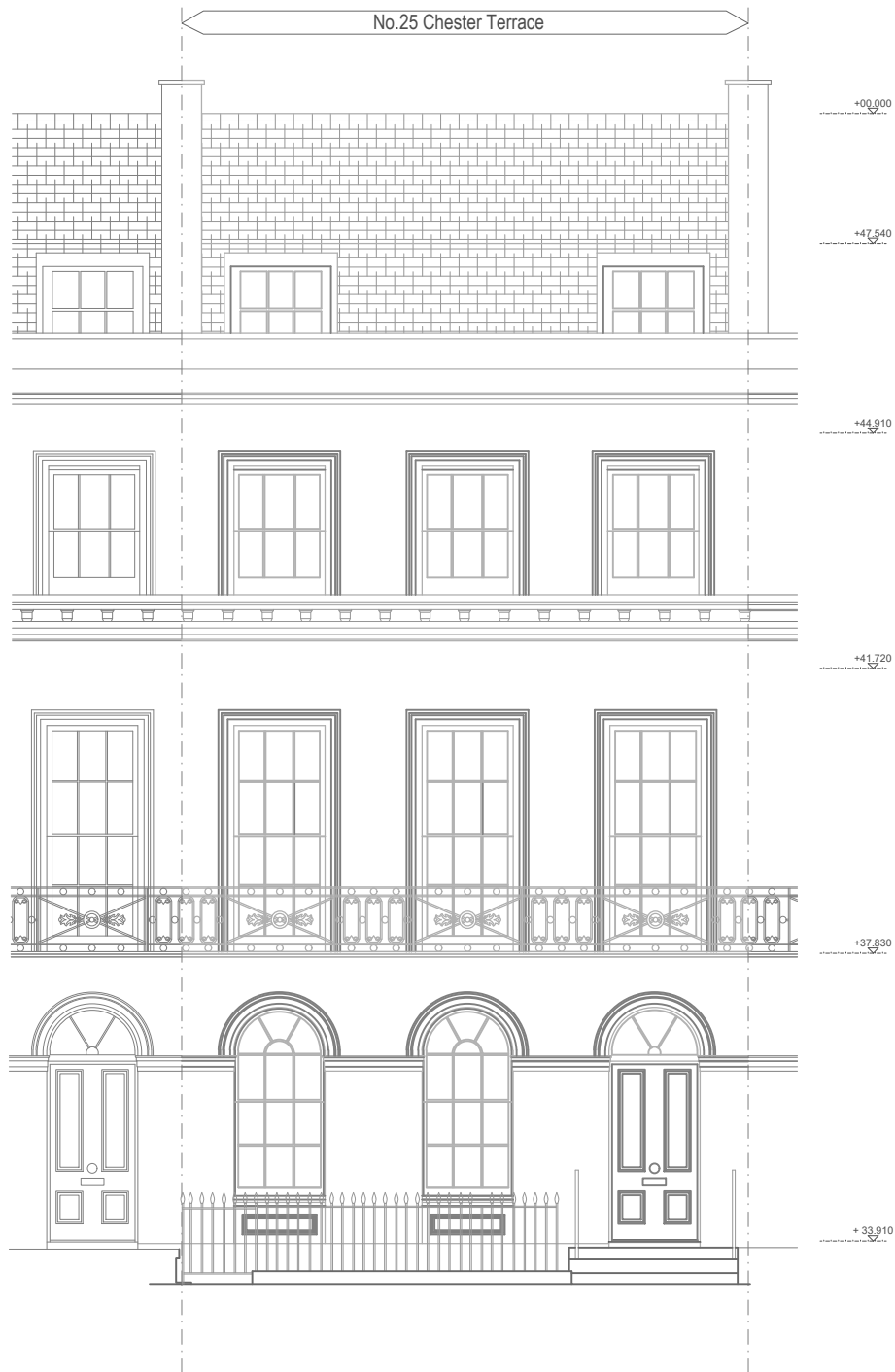
01 FRONT ELEVATIONS - PROPOSED SCALE 1:100 - @ A3