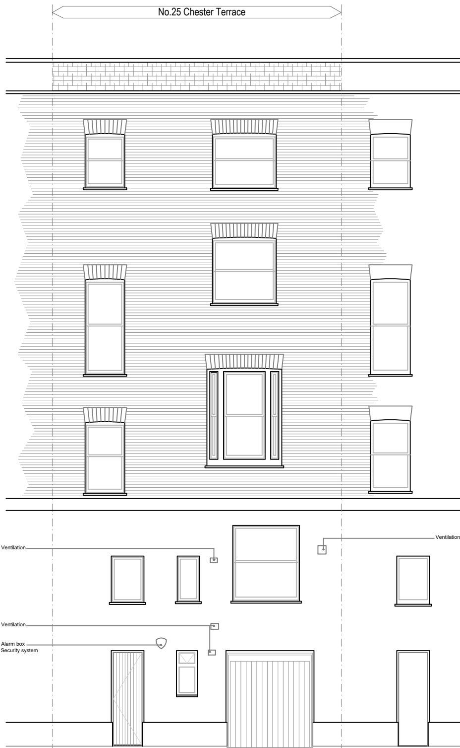
02 REAR EXTERIOR ELEVATION - EXISTING SCALE 1:100 - @ A3