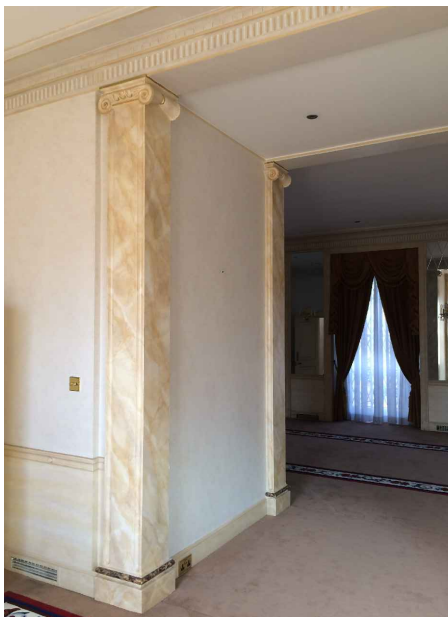
06 EXISTING COLUMN DETAIL TO BE RETAINED FIRST FLOOR EXISTING STUDY