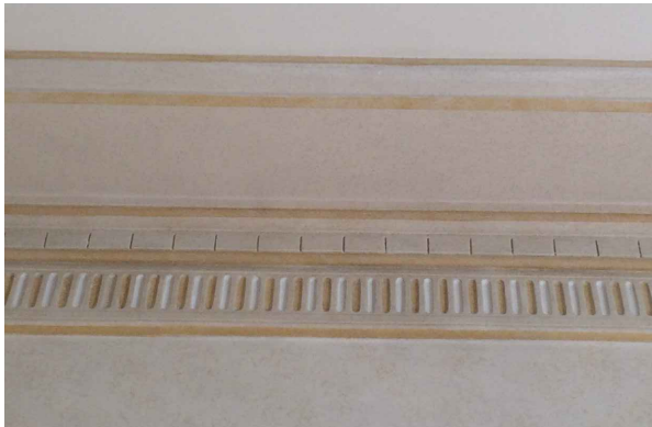
05 EXISTING CORNICE TO BE RETAINED FIRST FLOOR EXISTING SITTING ROOM