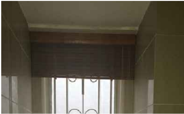
04 EXISTING CORNICE IMAGE GROUND FLOOR EXISTING CLOAK ROOM