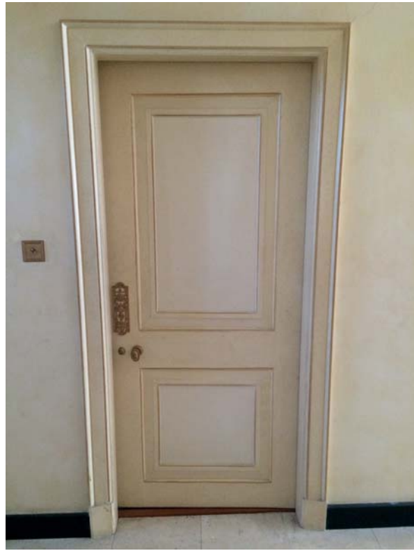
1 | GROUND FLOOR FRONT DAY ROOM DOOR