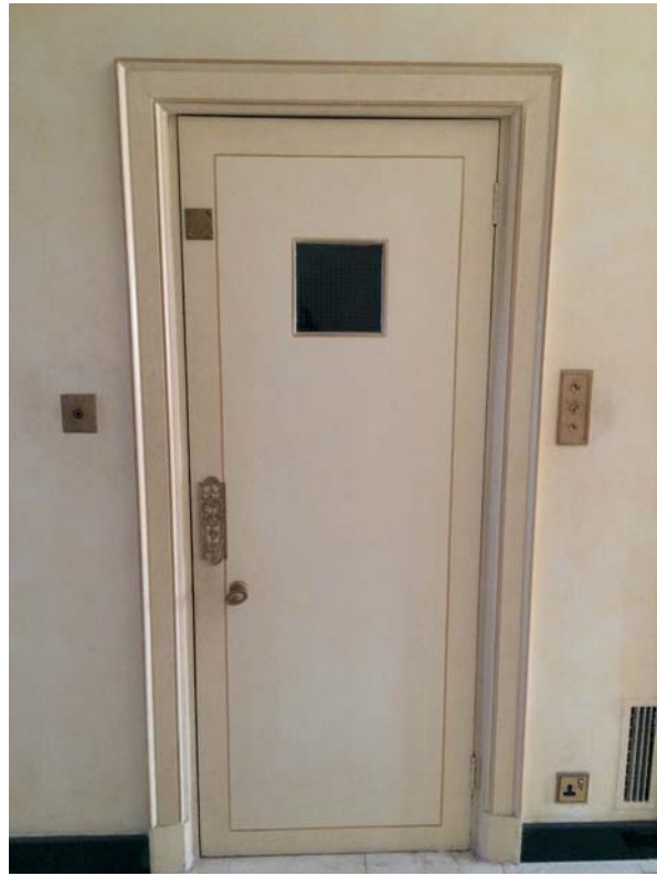
2 | GROUND FLOOR ELEVATOR DOOR