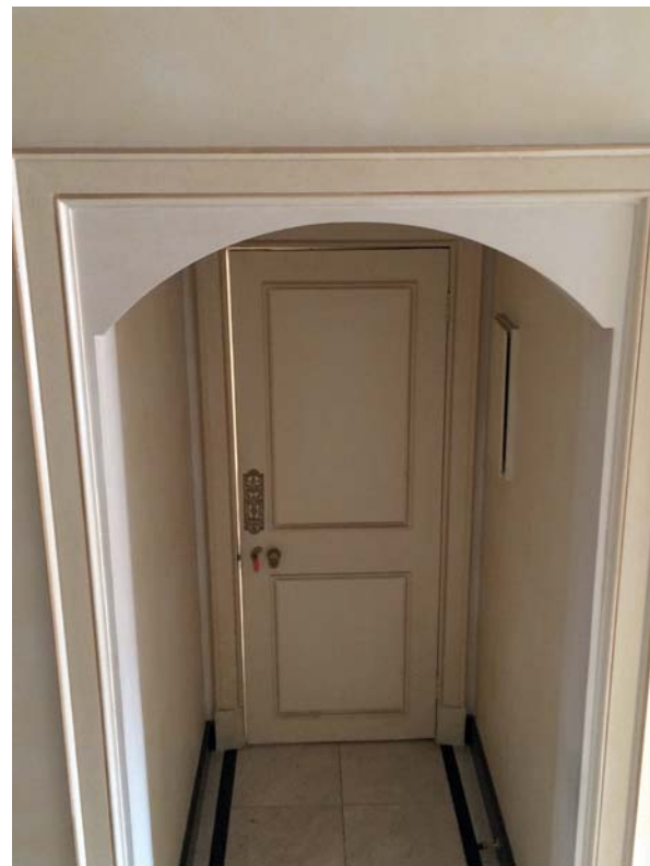
3 | GROUND FLOOR KITCHEN DOOR / VESTIBULE