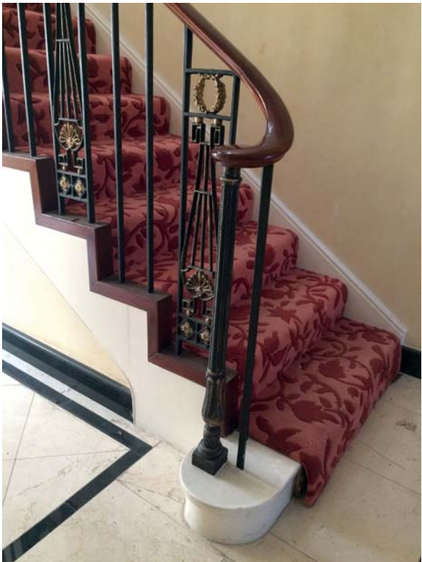
5 | GROUND FLOOR NULE POST