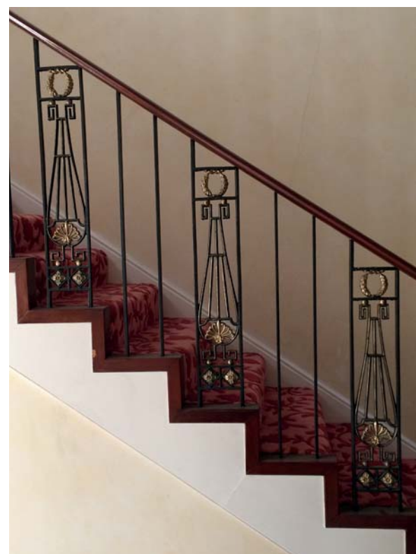
6 | GROUND FLOOR RAILING DETAIL