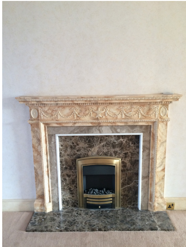
1. EXISTING FIRST FLOOR SITTING ROOM FIREPLACE