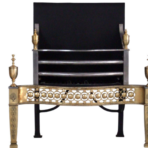
5. PROPOSED BASKET ROOM NO. 20 SITTING ROOM

Notes: 1. All scaled dimensions are to be confirmed with the Architect / Project Manager. 2. All related dimensions are to be taken in preference to the scaled dimensions. 3. All dimensions must be checked on site before fabrication. 4. Any errors or omissions must be reported to the Architect / Project Manager. 5. All rights described in Chapter IV of the Designs and Patents Act 1988 have been generally asserted. 6. This drawing is not to be produced in part or whole without prior express permission of Gartner Lewin Ltd. 7. Materials & workmanship shall be to the best of their respective kind and in accordance with all current British Standards & Codes of Practice Statutory Authority & Manufacturers Recommendations/Specifications.