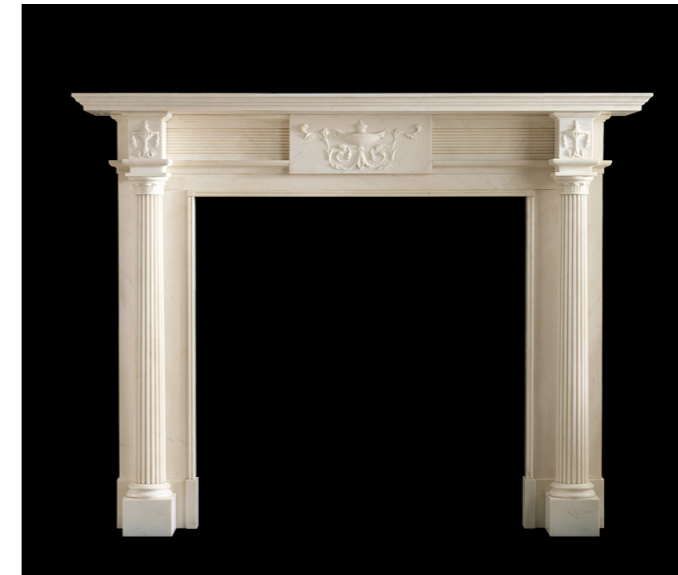
3. PROPOSED FIRST FLOOR FIREPLACE ROOM NO. 20 SITTING ROOM

Black Slate Back Hearth Black Slate Slips to suit 40" opening fireplace, Cararra marble surround sizes to be proportional and to match as close as possible to existing