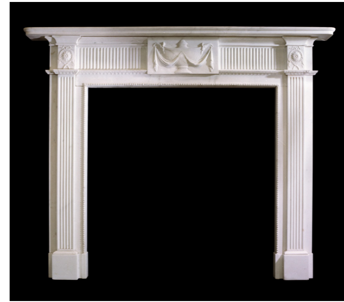
3. PROPOSED GROUND FLOOR FIREPLACE ROOM NO. 14 PROPOSED DINING ROOM

Black Slate Back Hearth Black Slate Slips to suit 40" opening fireplace, Cararra marble surround sizes to be proportional and to match as close as possible to exist.