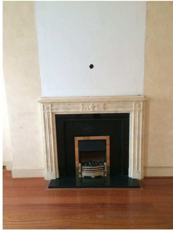
1. EXISTING GROUND FLOOR FRONT DAY RM / DINING RM FIREPLACE