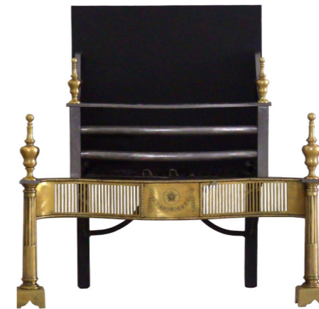
5. PROPOSED BASKET ROOM NO. 14 PROPOSED DINING ROOM

Notes: 1. All scaled dimensions are to be confirmed with the Architect / Project Manager. 2. All noted dimensions are to be taken in preference to the scaled dimensions. 3. All dimensions must be checked on site before fabrication. 4. Any errors or omissions must be reported to the Architect / Project Manager. 5. All rights described in Chapter IV of the Designs and Patents Act 1988 have been generally asserted. 6. This drawing is not to be produced in part or whole without prior express permission of Gartner Lewin Ltd. 7. Materials & workmanship shall be to the best of their respective kind and in accordance with all current British Standards & Codes of Practice Statutory Authority & Manufacturers Recommendations/specifications.