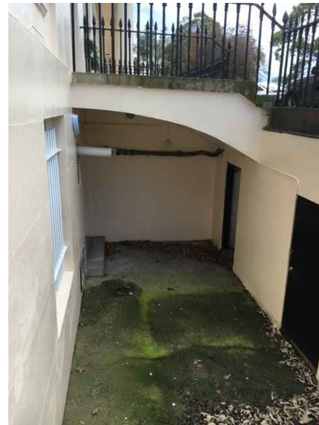
02 IMAGE 1