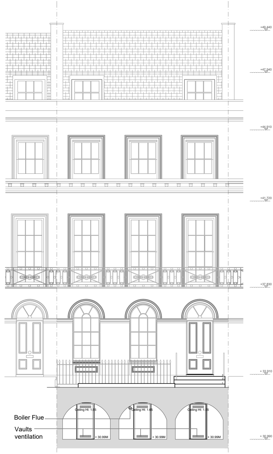
01 SECTION D-D SCALE 1:100 - @ A3