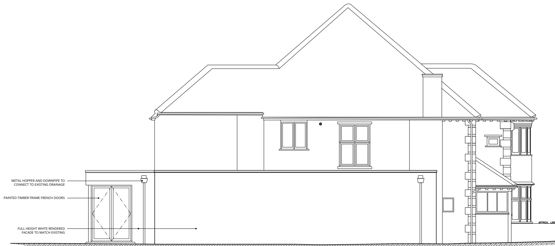
PROPOSED FLANK ELEVATION Scale 1:100