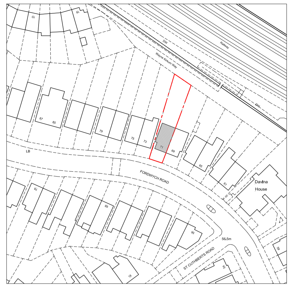
Location Plan scale 1:1250