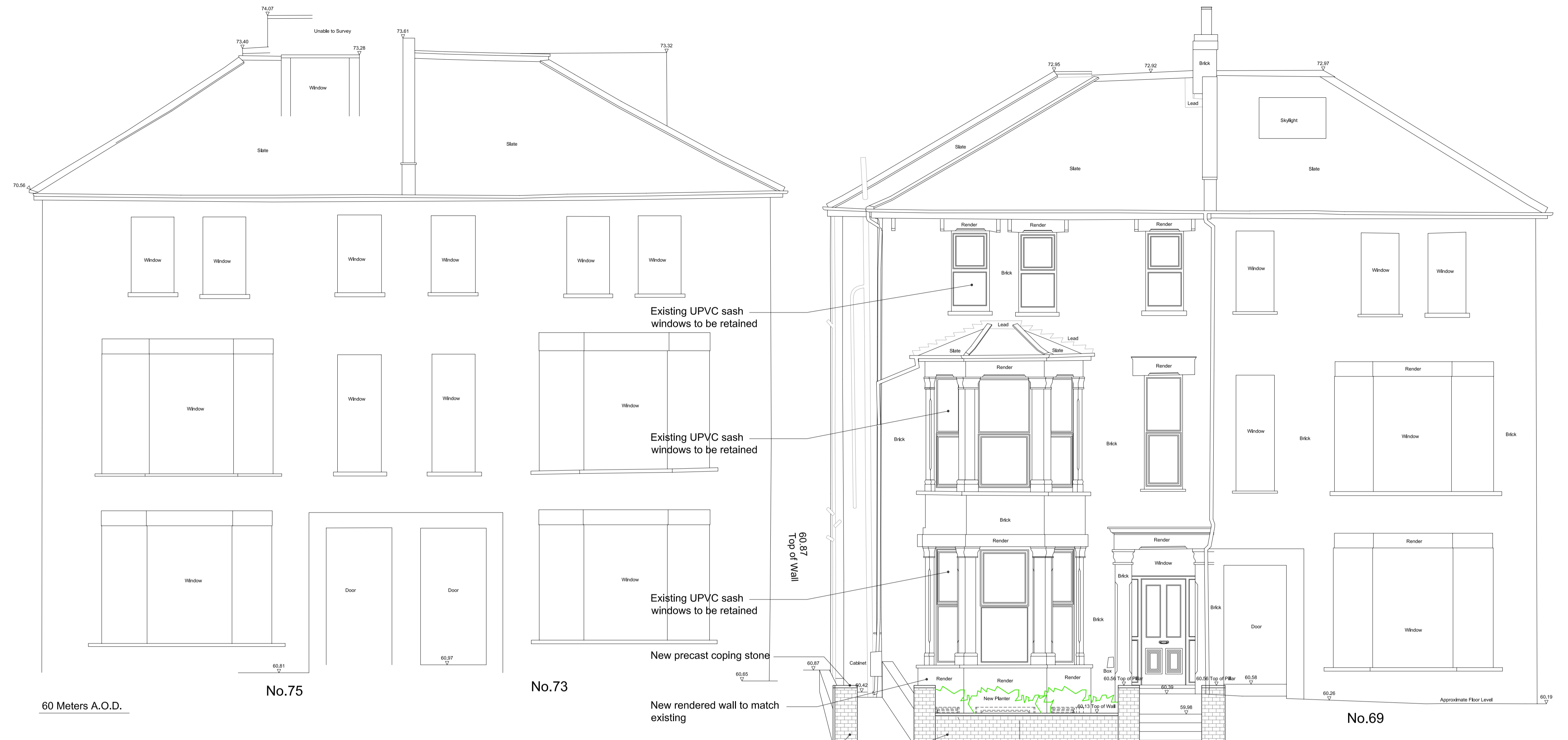
1 Proposed Street Elevation 0 1 3m