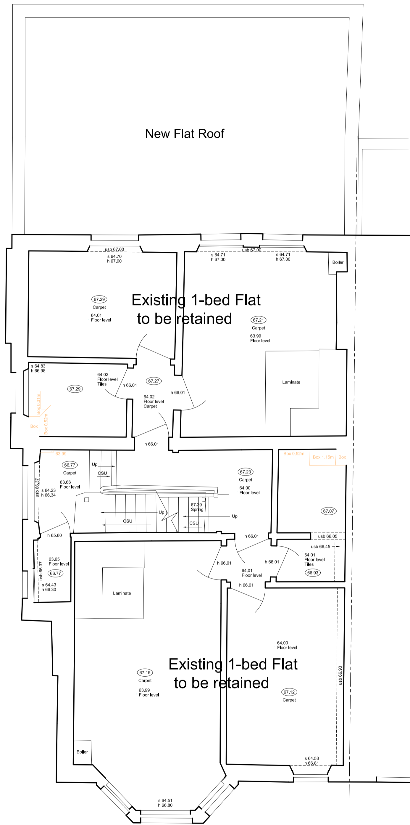
1 Existing First Floor Plan with Proposed New Rear Flat Roof