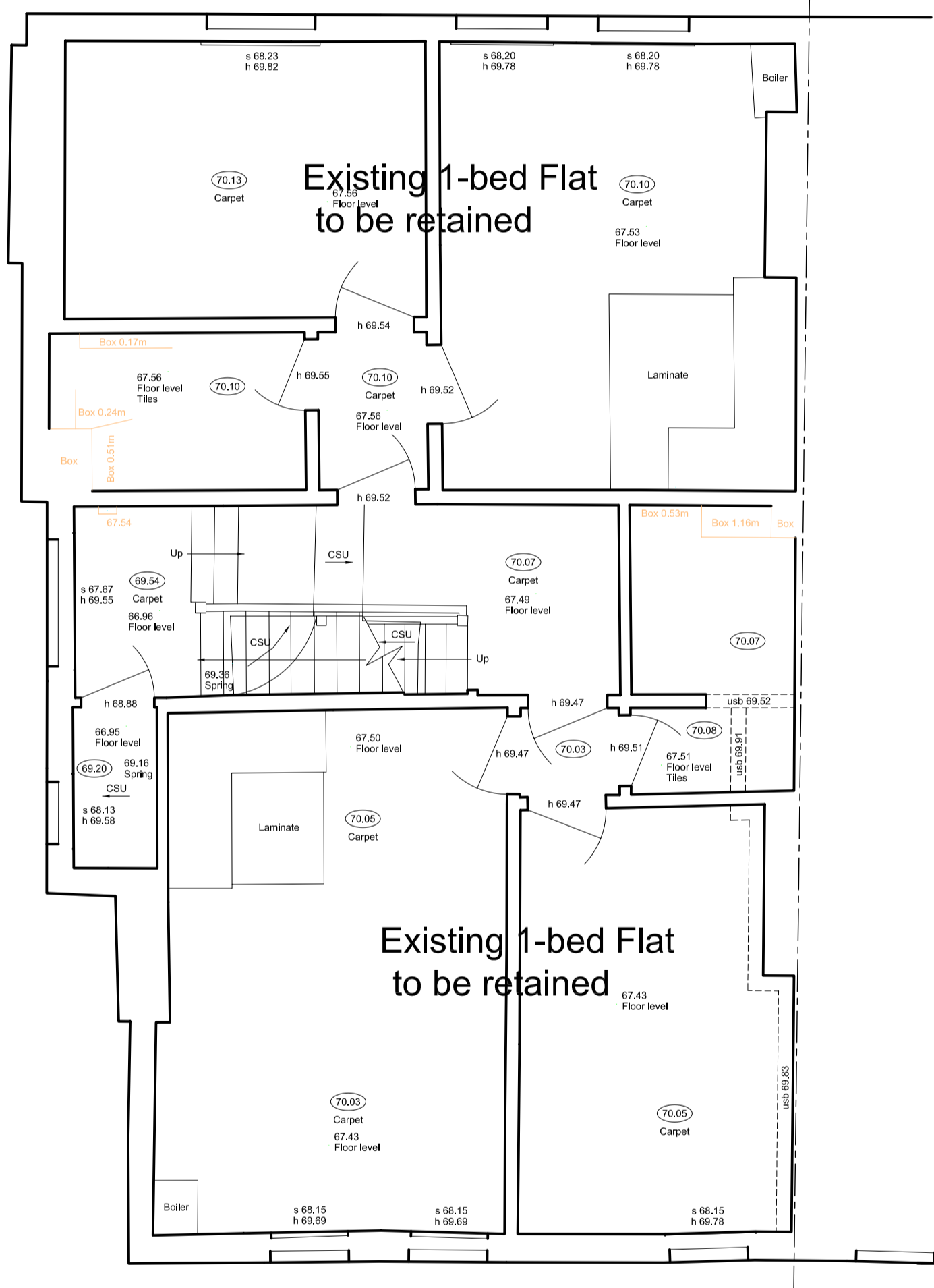
2 Existing Second Floor Plan to be retained