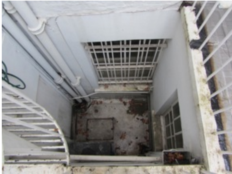
3. Rear Light well