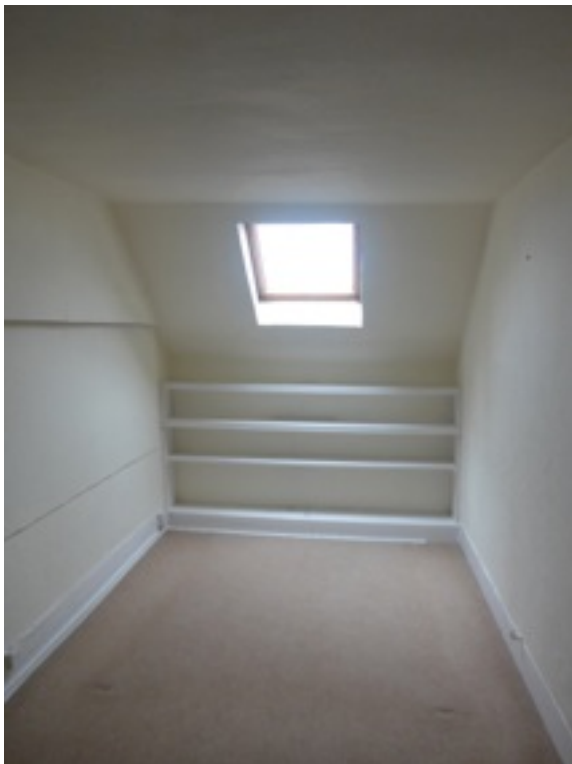
22. Fourth Floor Rear Room