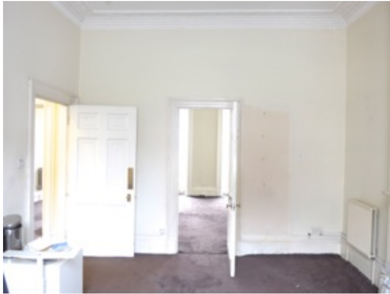
15. First Floor Rear Room