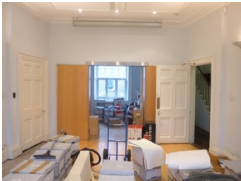
12. Ground Floor Front Room overlooking to the Rear Room