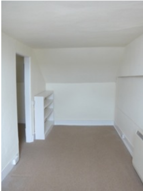
21. Fourth Floor Front Room