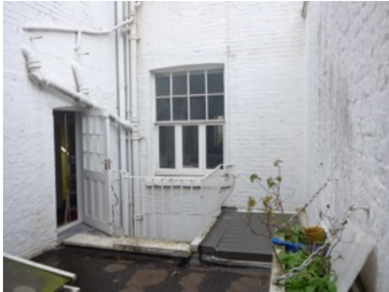
5. Rear Elevation, Ground Floor Level