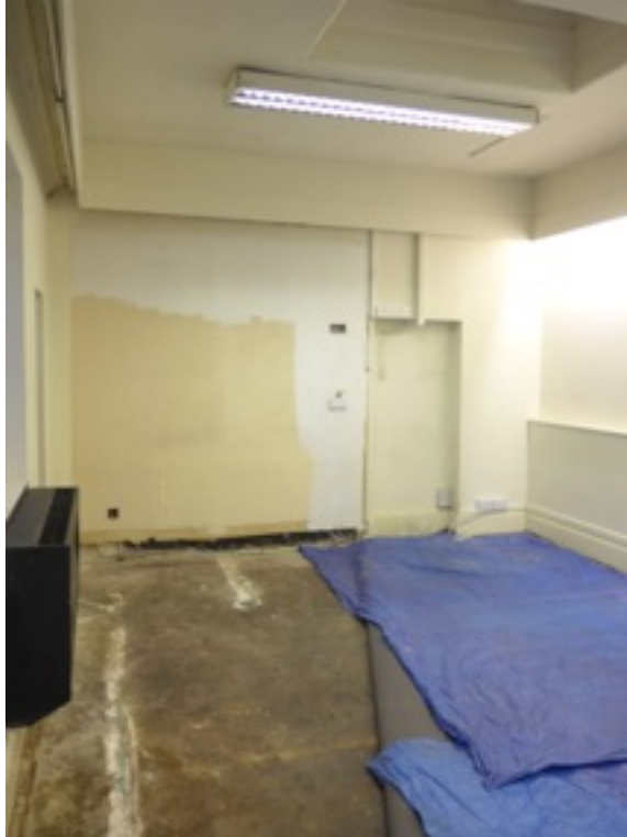
10. Basement Rear Room