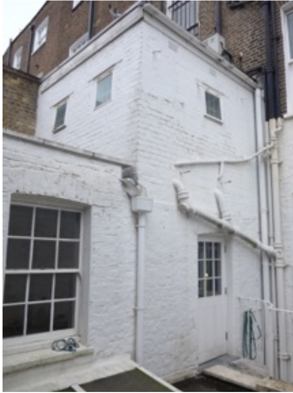
7. Rear Extension