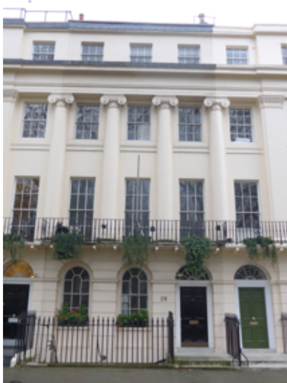
1. Front elevation