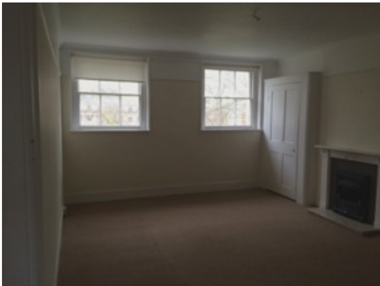
18. Third Floor Front Room