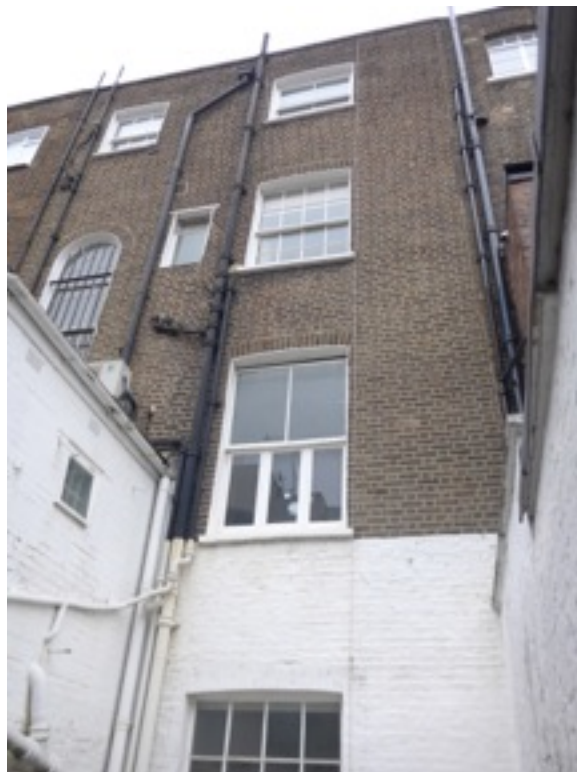
6. Rear Elevation