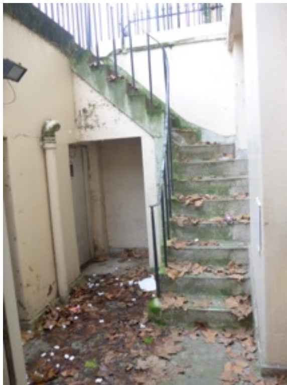
2. Front Lightwell