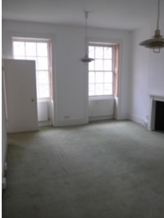
16. Second Floor Front Room