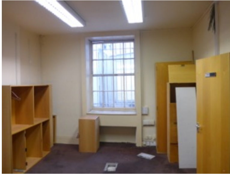
9. Basement Rear Room