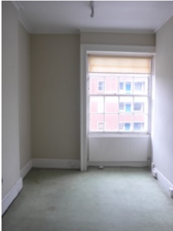
17. Second Floor Rear Room