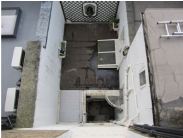
4. Rear Courtyard