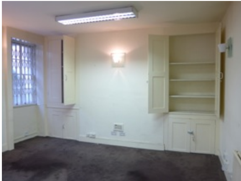
8. Basement cupboards retained and refurbished