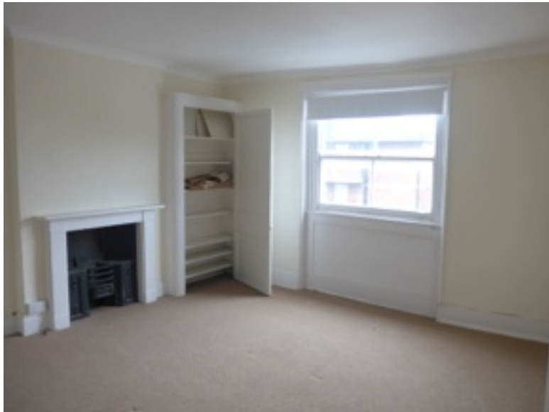
19. Third Floor Rear Room