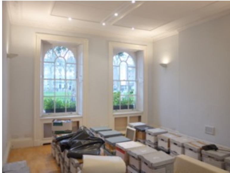
11. Ground Floor Front Room