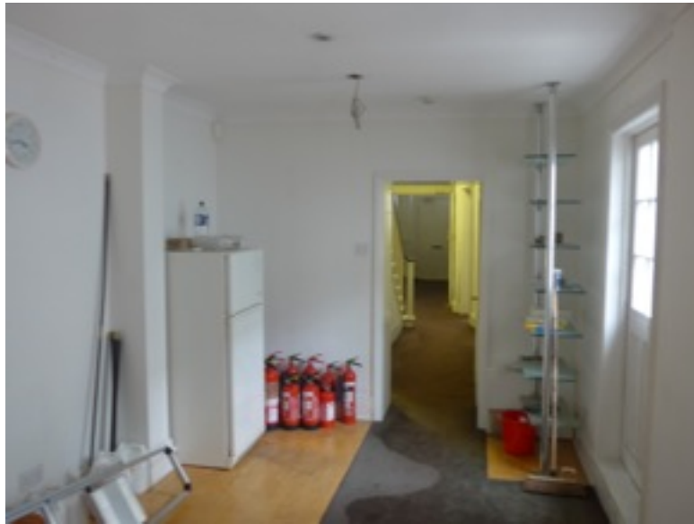
13. Ground Floor Rear Extension