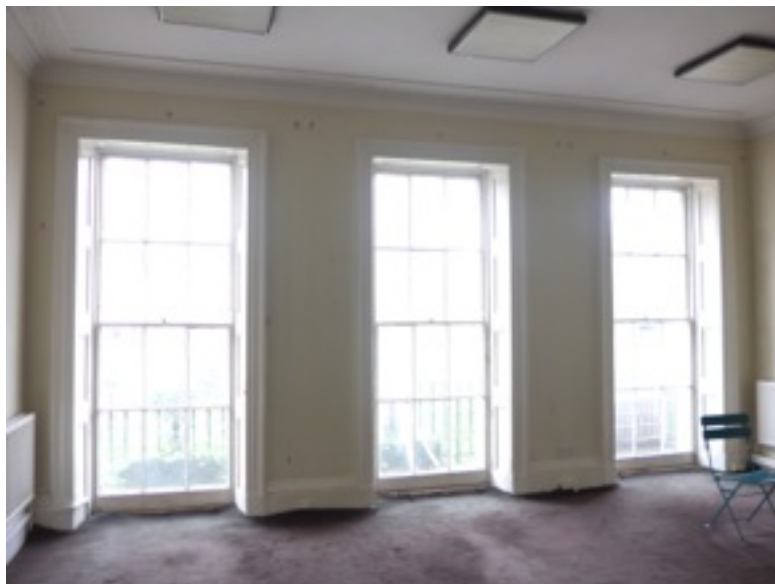
14. First Floor Front Room