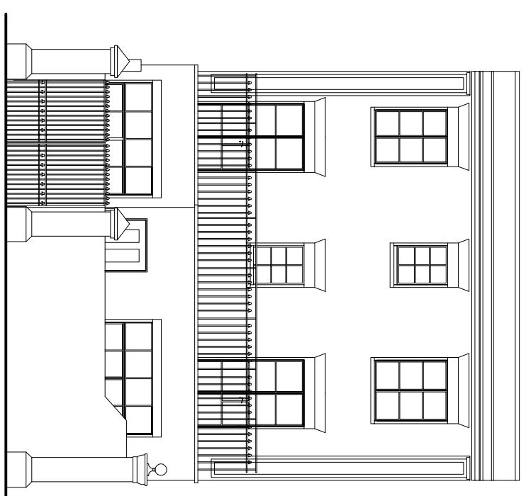
PROPOSED FRONT GATE ELEVATION