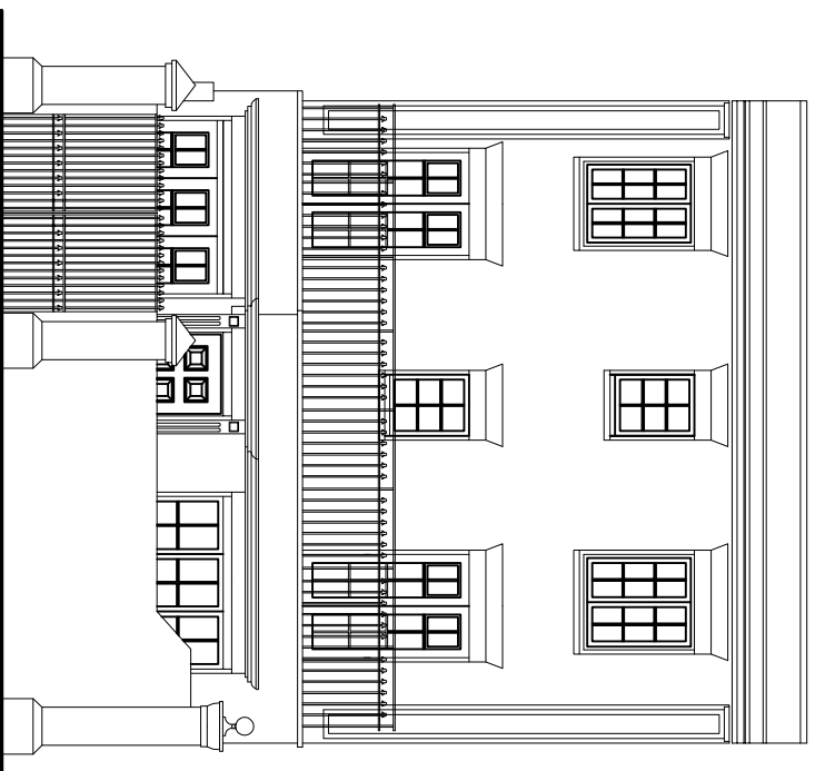
EXISTING FRONT GATE ELEVATION