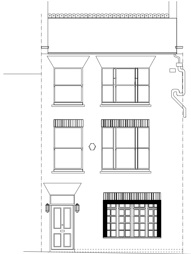
Pre-Existing Front Elevation

NOTES Dimensions are in millimetres unless stated otherwise. Levels are in metres AOD unless stated otherwise. Dimensions govern. Do not scale off drawing. All dimensions to be verified on site before proceeding. All discrepancies to be notified in writing to architects.