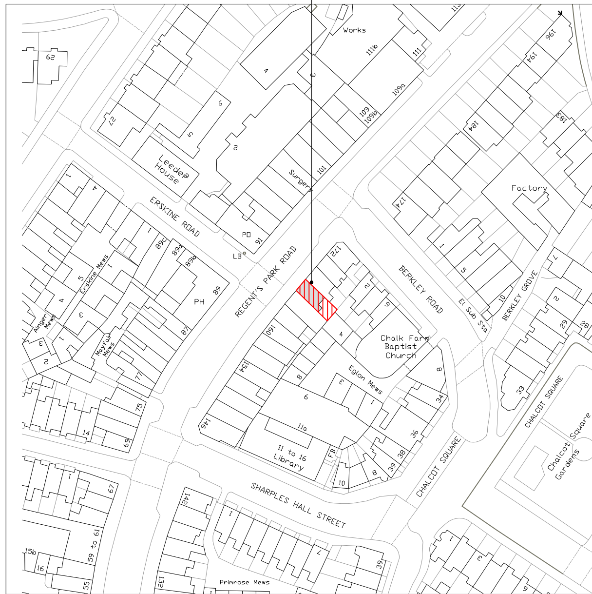
EXISTING LOCATION PLAN scale 1:1250