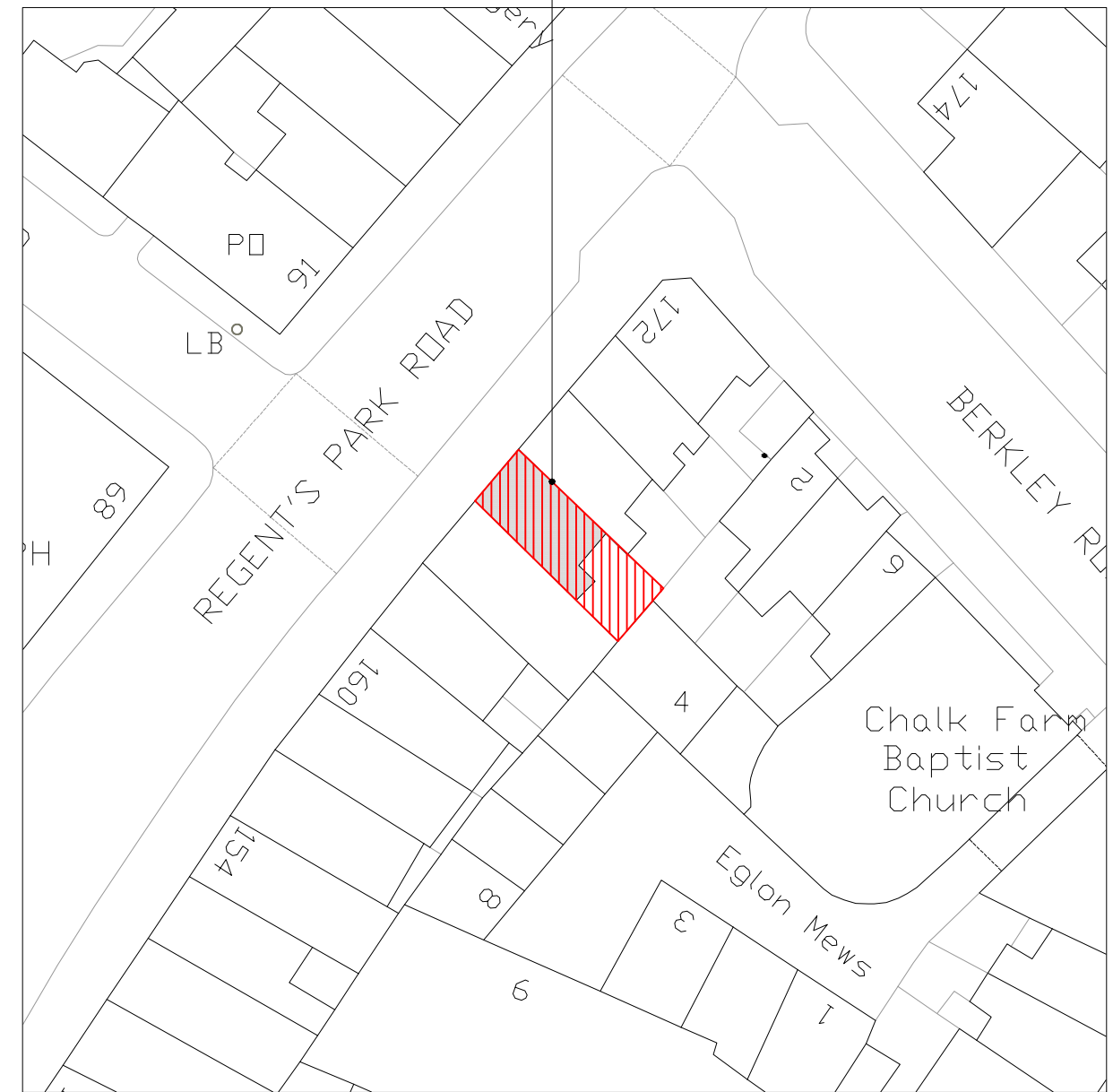
EXISTING SITE PLAN scale 1:500