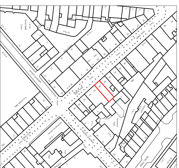
SCALE : 1:1250@A3