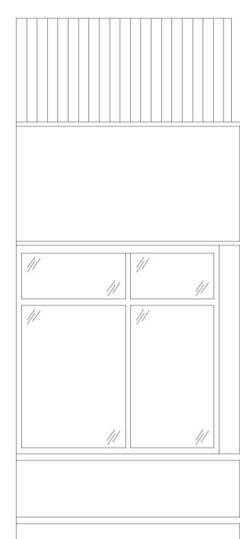
SIDE ELEVATION GOTTFRIED MEWS

NOTES: No dimensions are to be scaled from this drawing. All dimensions are to be checked on site, where discrepancy occurs between specification and drawings the supervising officer must be notified.