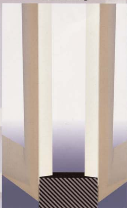
For varied wall thickness/ flush fitting