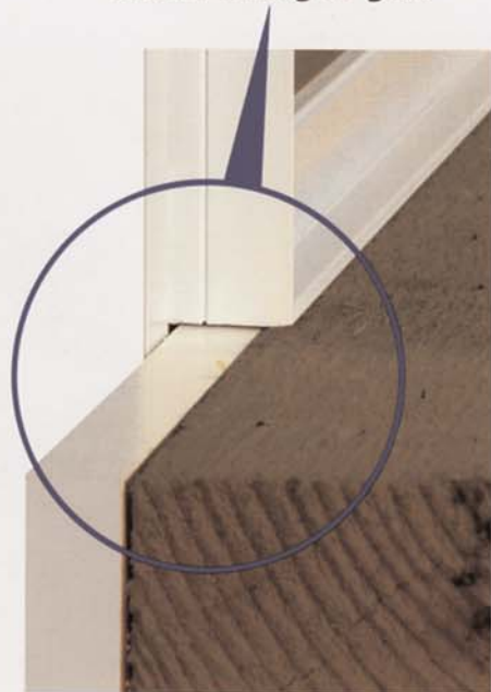
Screw fitting or glue