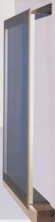
Window with reveal frame