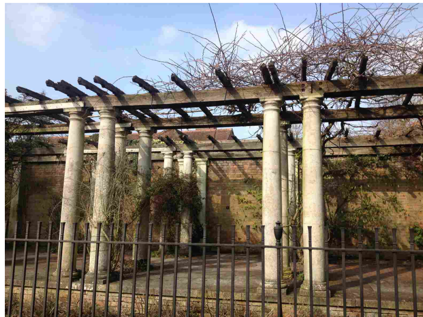
Photo of typical bay