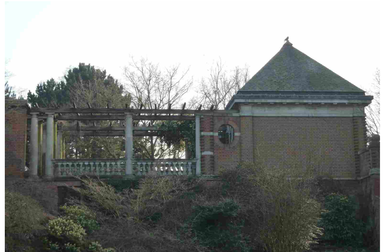
View of Colonnade of North