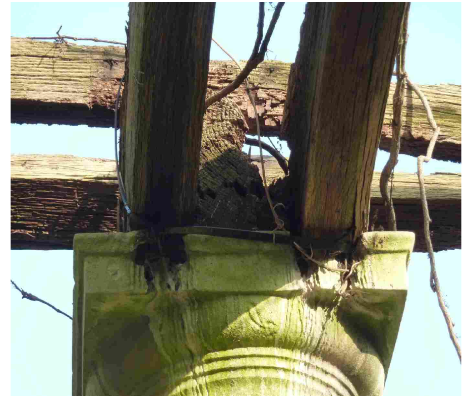
Photo showing timber decay to primary and secondary frame and stone capital corrosion