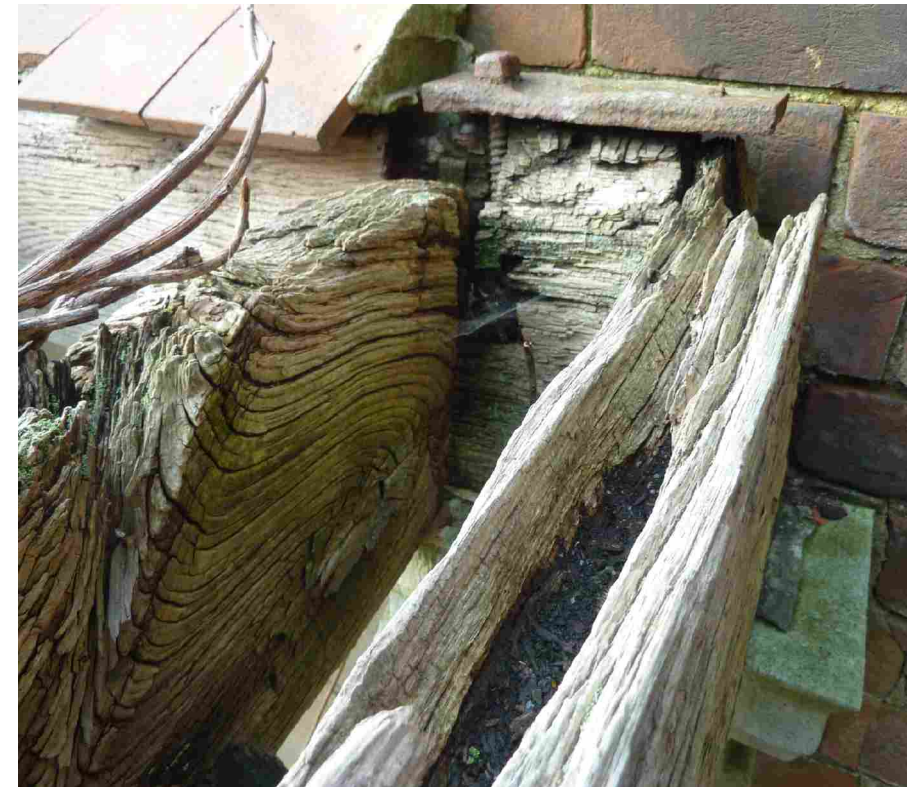
Primary oak frame decay at North-East end corner of Colonnade