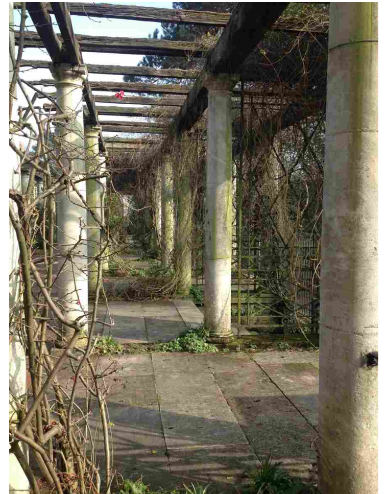
Photo of Colonnade oak timber frame looking East