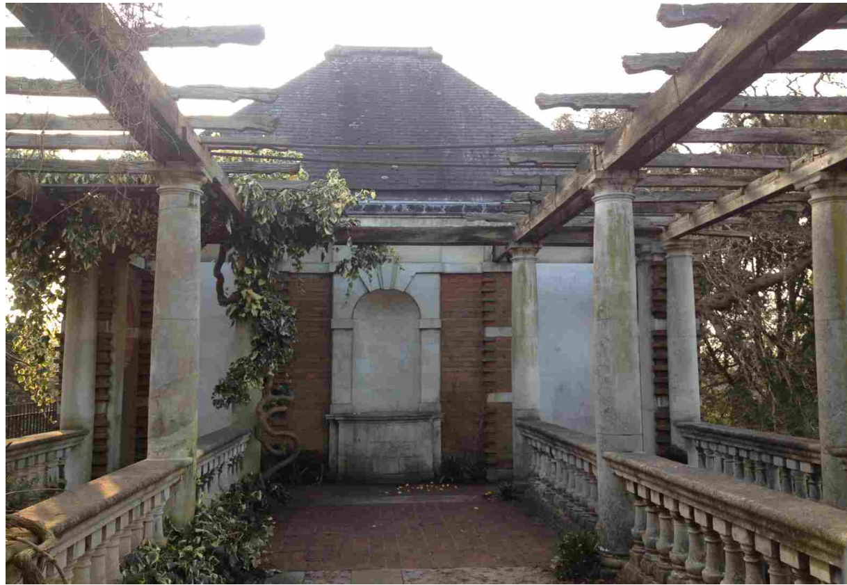
Photo of West end of Colonnade and Belvedere