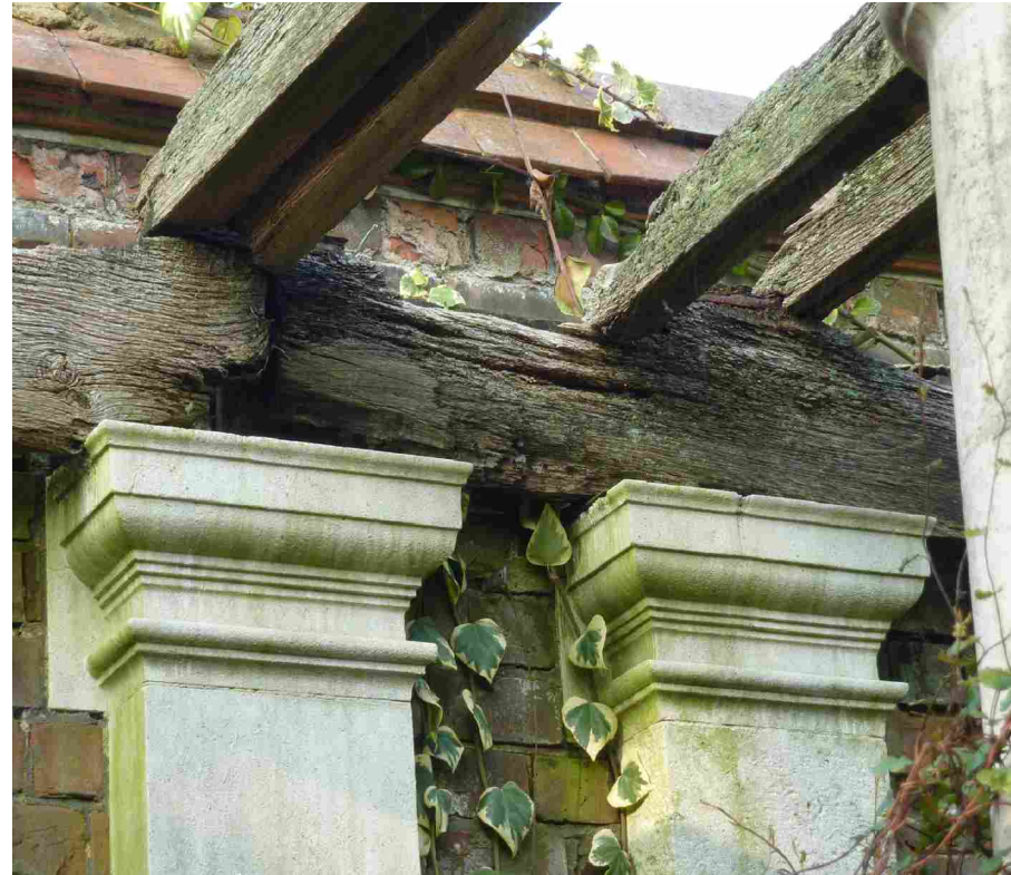
Photo showing timber decay to primary and secondary frame along North boundary brick wall