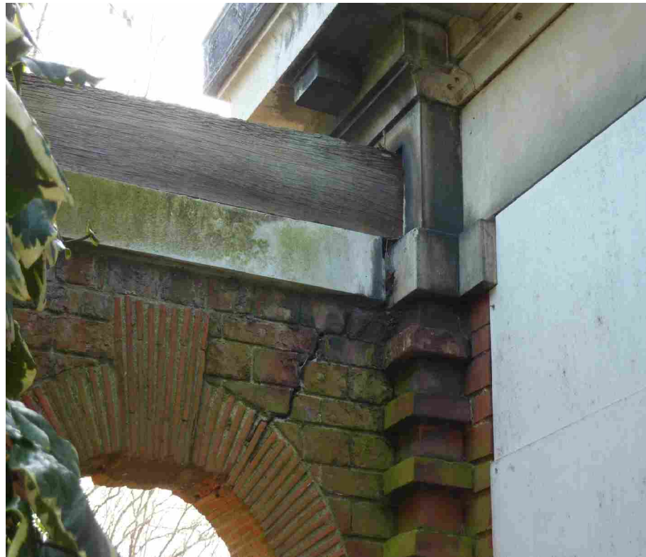
Photo showing primary timber frame connection to Belvedere wall *note crack on stone cornice and brick masonry below