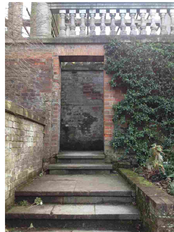
Access opening to Colonnade from North