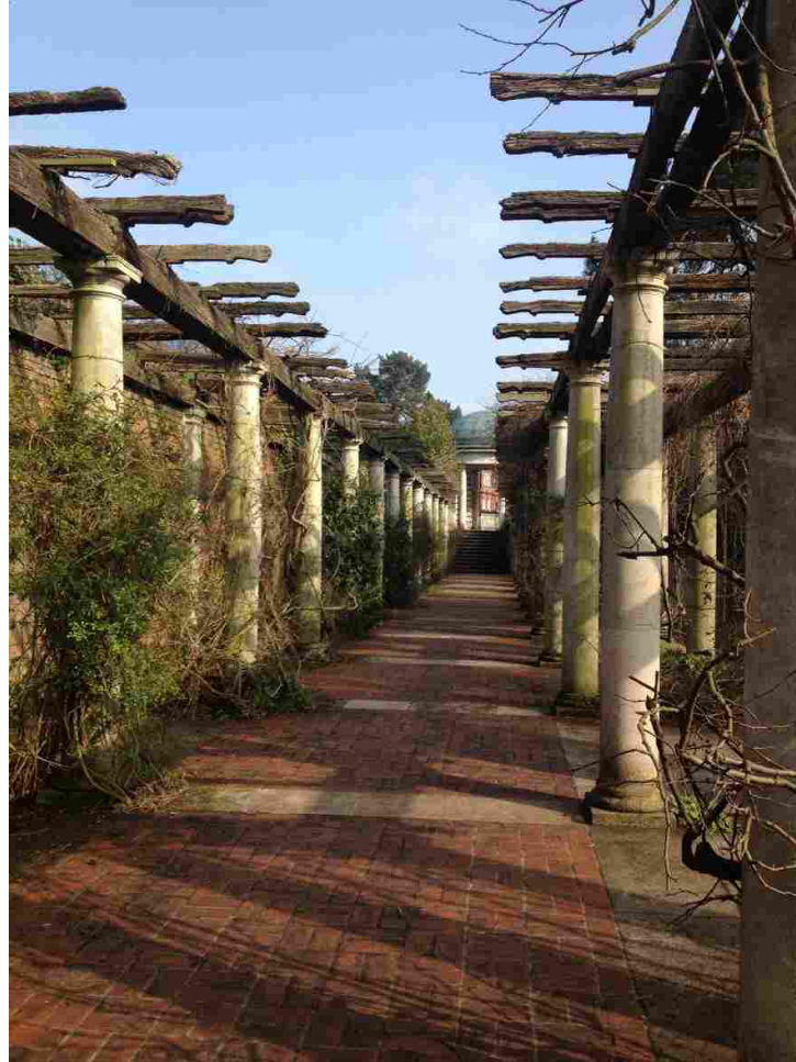
View of Colonnade looking East