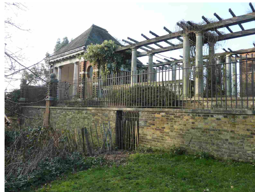
View of Colonnade and Belvedere from South