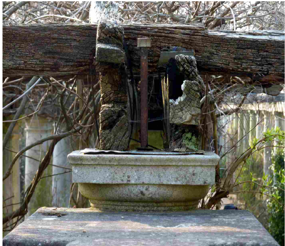
Photo showing timber decay to primary and secondary frame, rusted iron bolt and inadequate lead sheet above capital