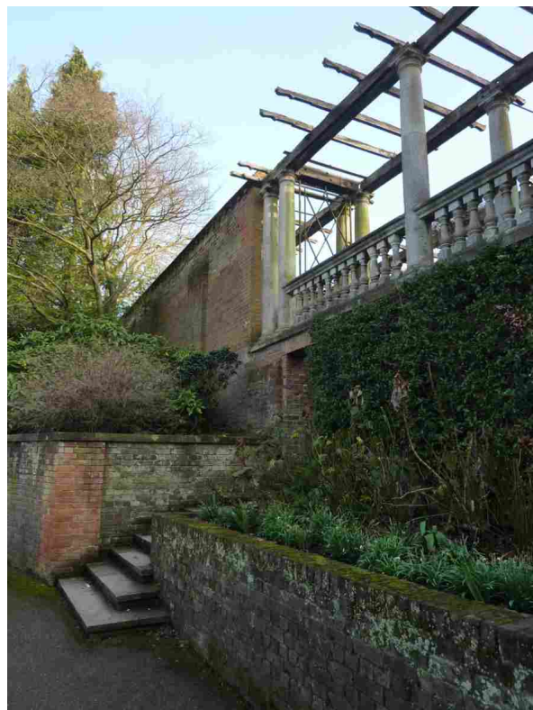
Access to Colonnade from North