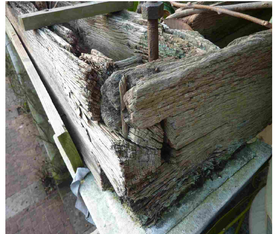
Primary oak frame decay at South-East end corner of Colonnade