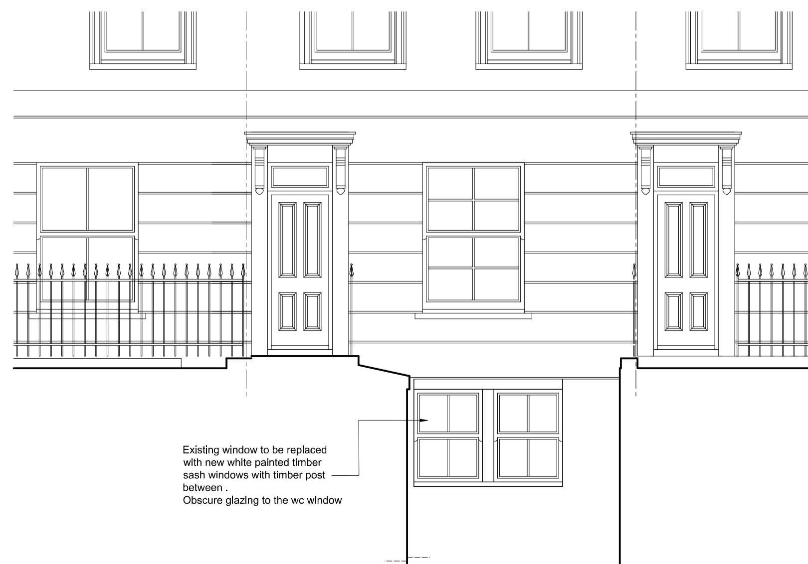
Front elevation (Lower ground)