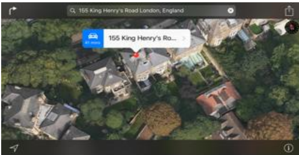
Image 4 Rear elevation