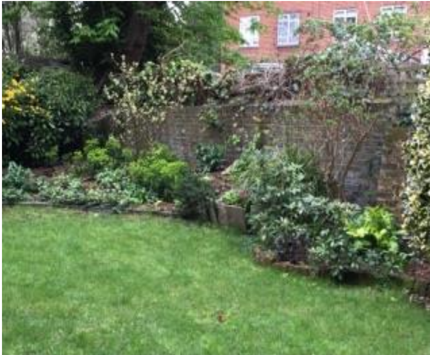
Image 1, rear elevation facing south east. Showing the existing garden space