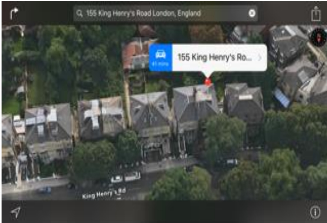
Image 5 Front elevation