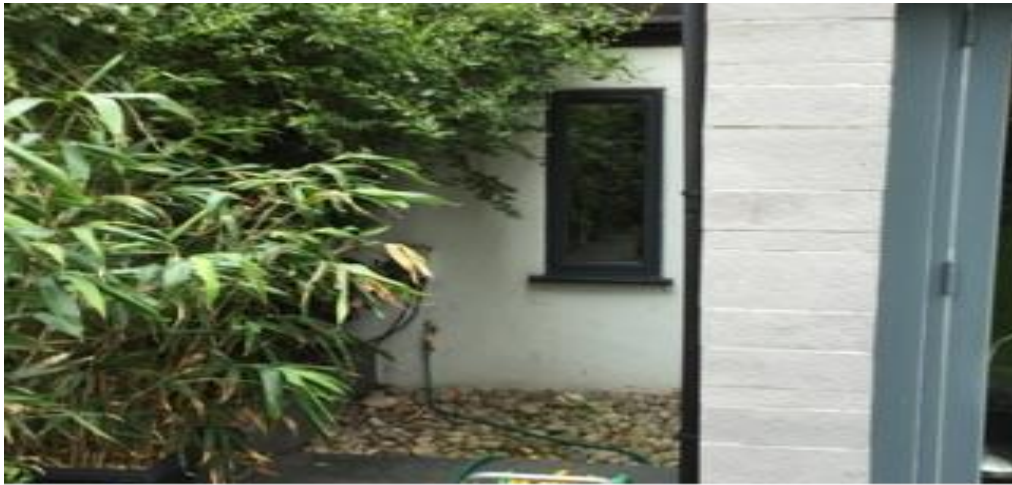
Image 3 Existing side extension