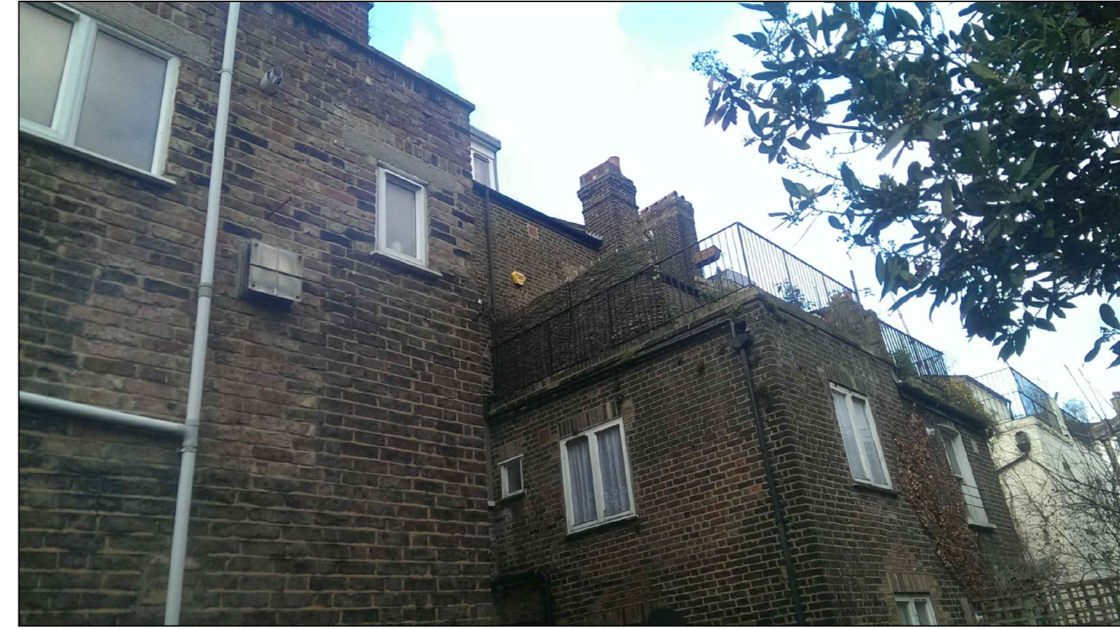
VIEW TO REAR OF 86/88 ST AUGUSTINE’S ROAD.