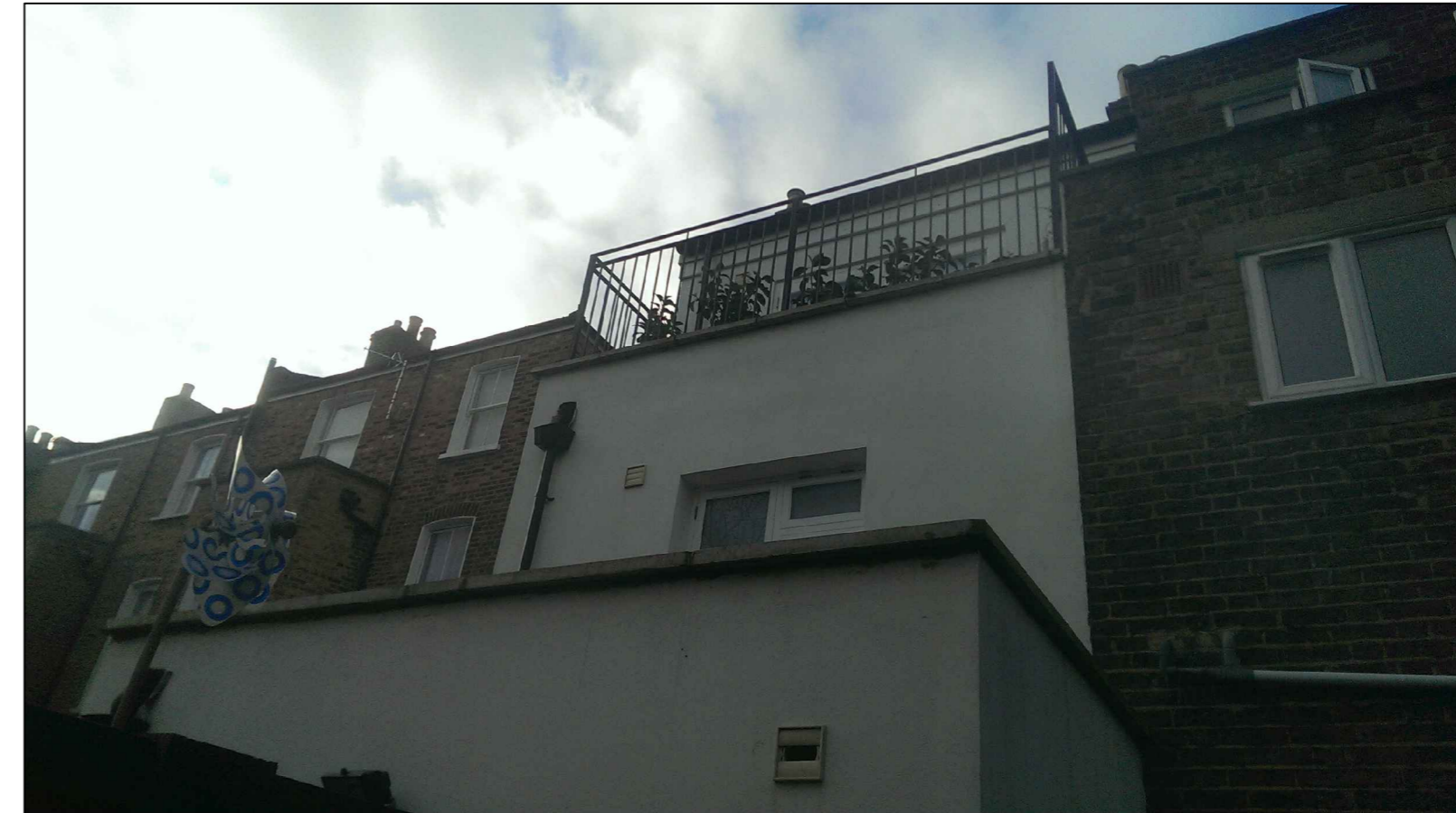
VIEW TO REAR OF 82 ST AUGUSTINE’S ROAD.