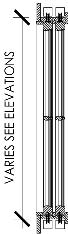
HORIZONTAL SECTION SHOWING ASTRAGAL/ GLAZING BARS