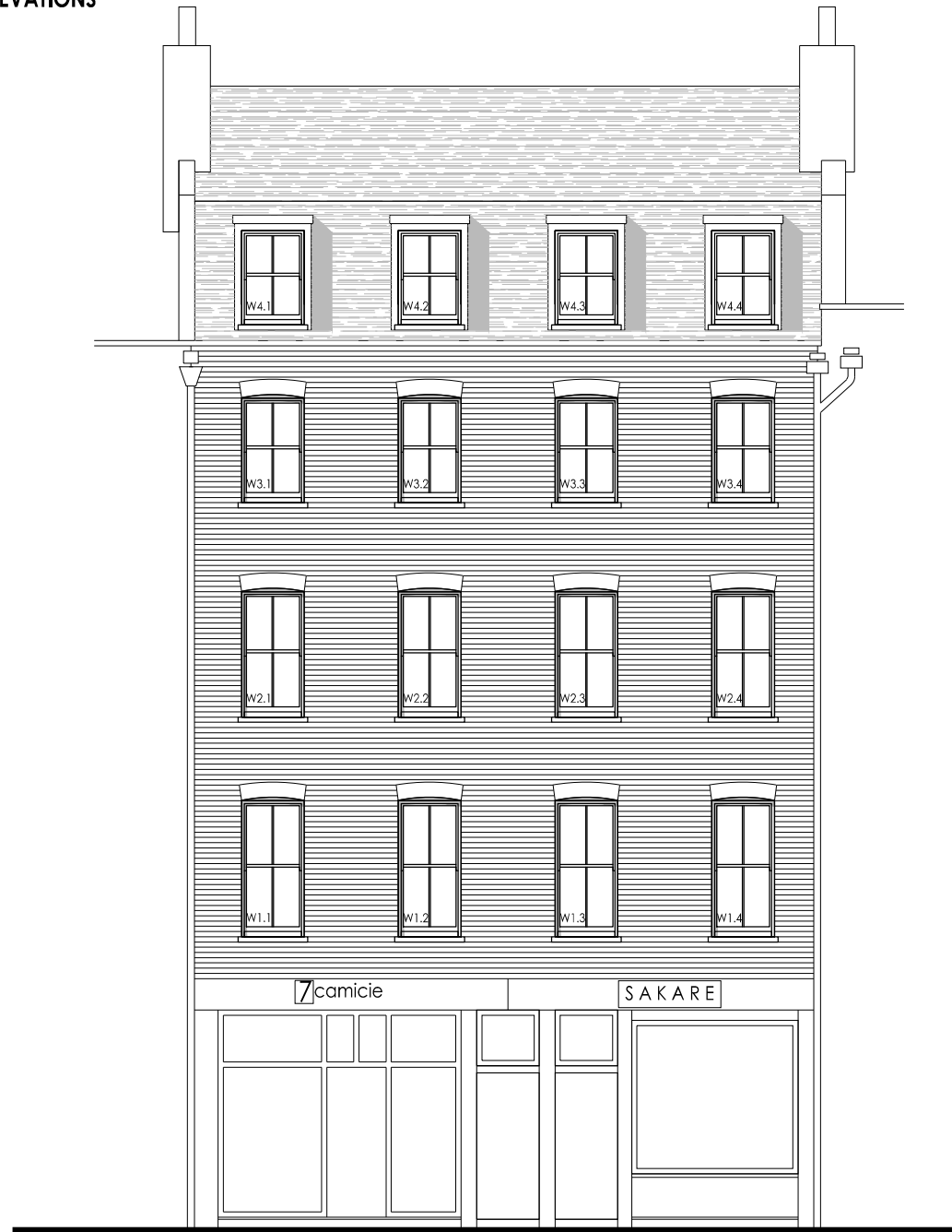
PROPOSED SOUTHWEST (FRONT) ELEVATION (FRONTS ONTO NEAL STREET)