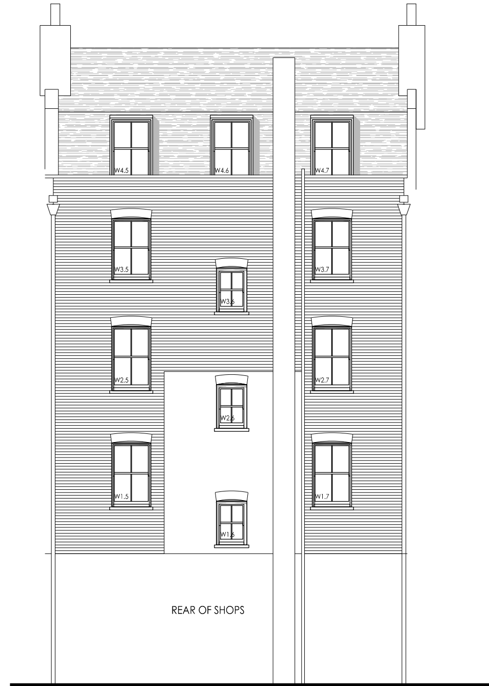
PROPOSED NORTHEAST (REAR) ELEVATION