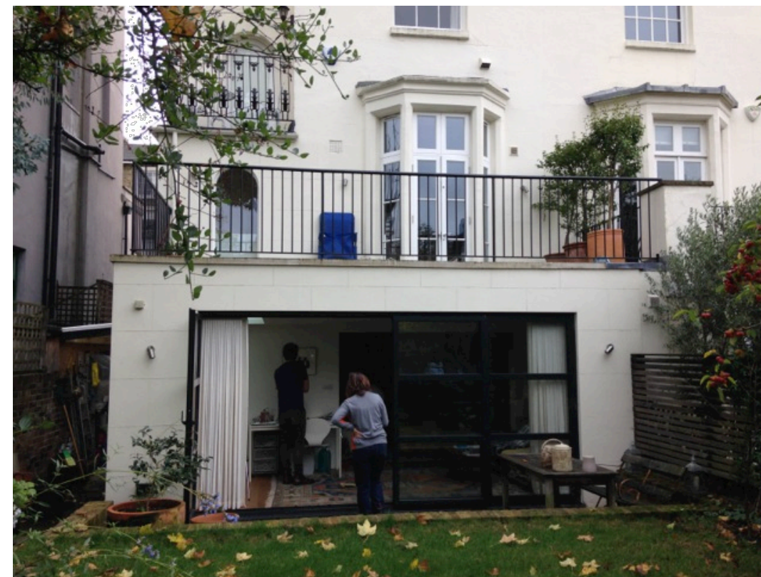
Rear of Neighbours Extension - External View

Notes Do not scale from drawings. Errors to be reported immediately to the Architect. To be read in conjunction with all relevant Architects', Services and Structural Engineers' drawings. All existing site, trees and building information has been compiled from different sources. All dimensions to be checked on site.