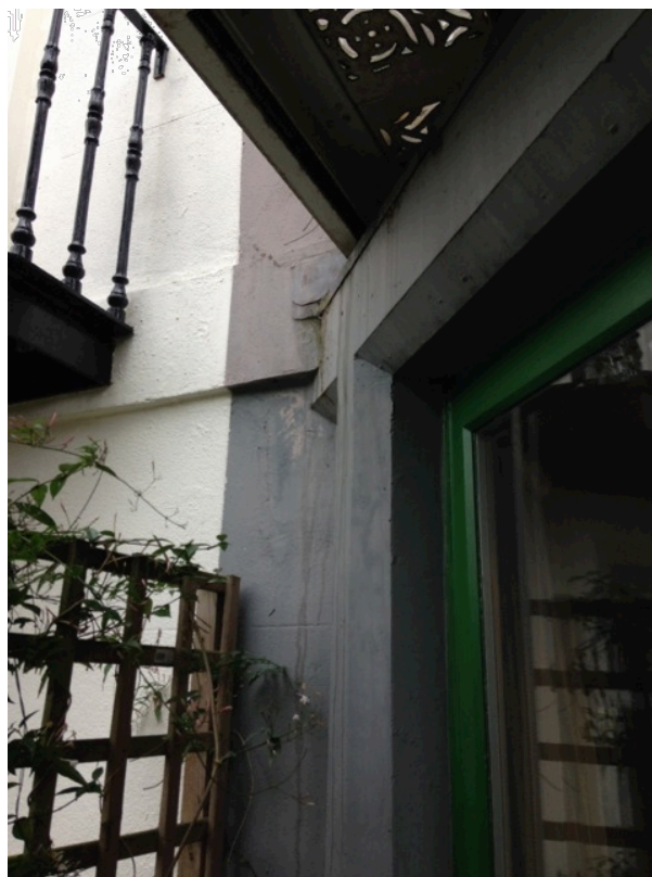
Rear Basement Bay Window - Adjoining Wall