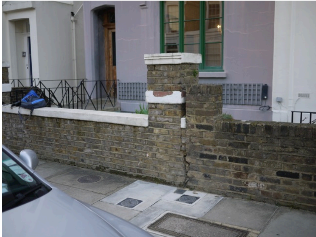
Frontage Image 01 - Adjoining Wall