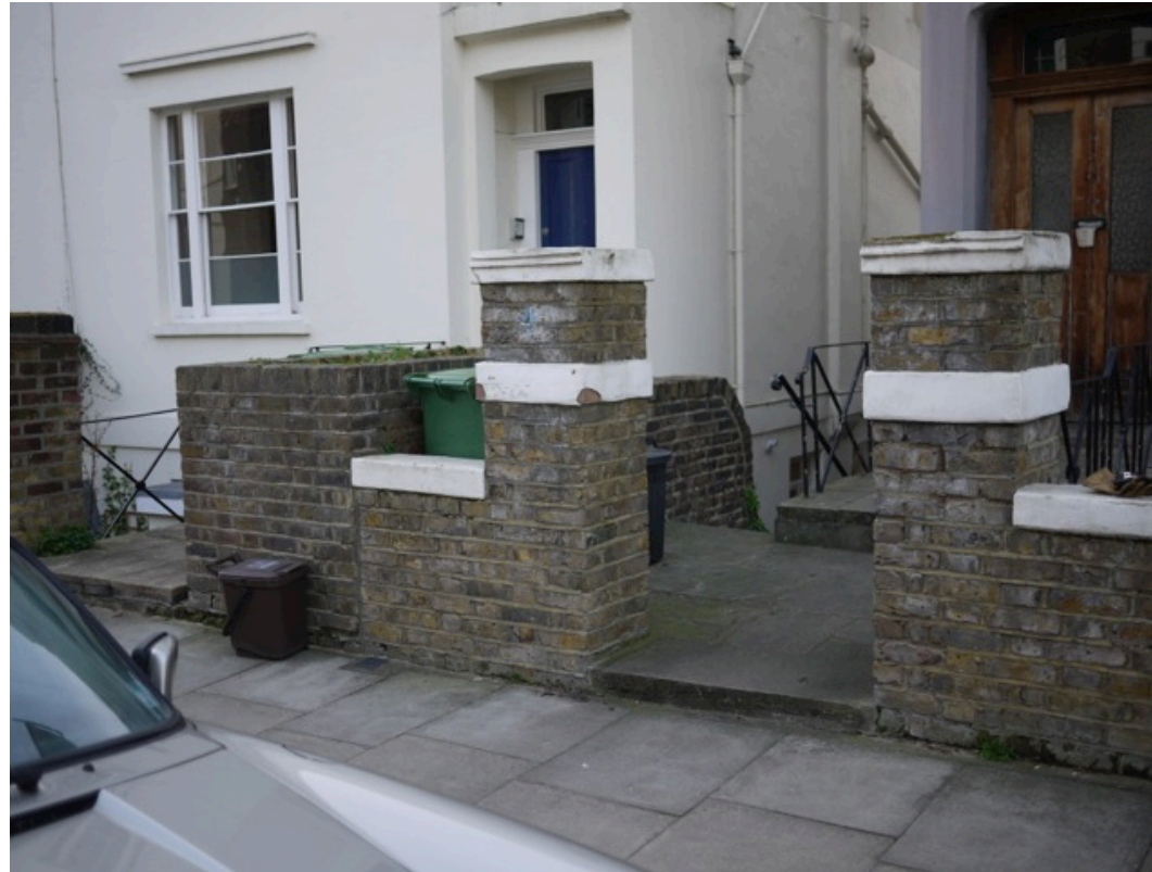
Frontage Image 02 - Adjoining Wall